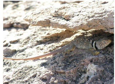
Great Basin Collared Lizard