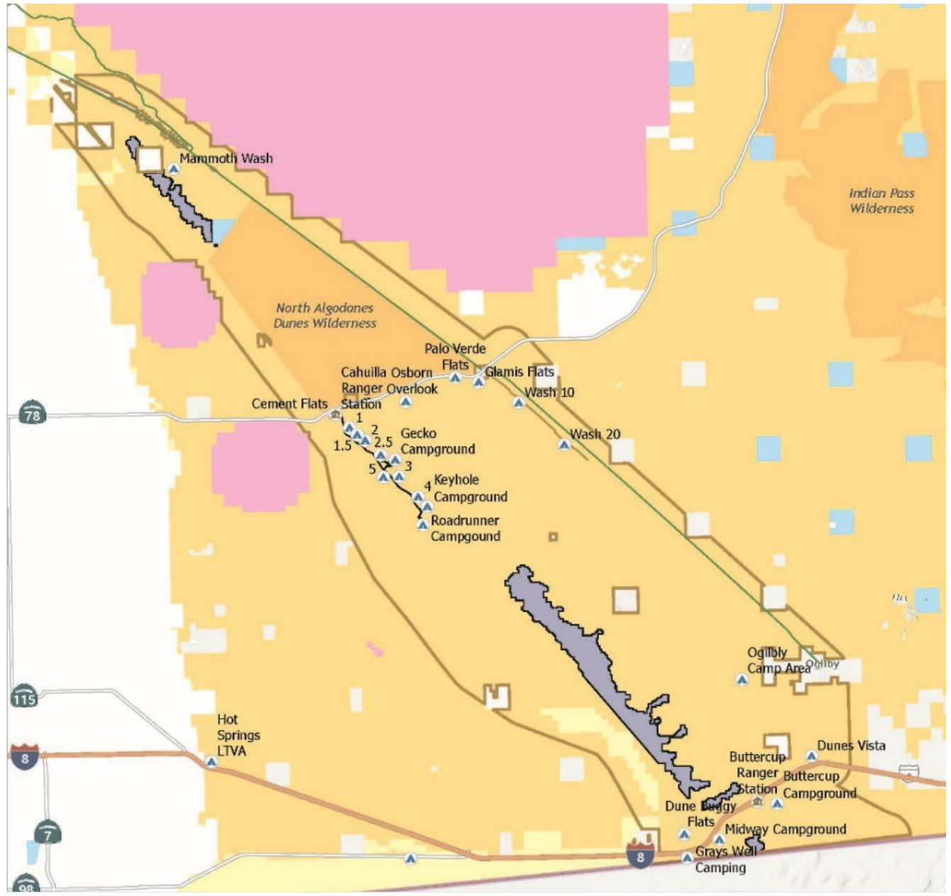
Map 1: Imperial Sand Dunes Recreation Area

Map, Imperial Sand Dunes Recreation Area