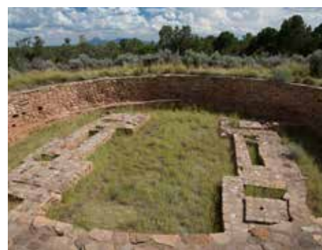
At 47 feet in diameter, the Lowry Great Kiva is one of the largest kivas in this area.

Lowry Pueblo is a 1,000-year-old Ancestral Puebloan village named after George Lowry, an early 20 th century homesteader. Lowry Pueblo was built on top of the houses of an earlier community around AD 1060, and inhabited for about 165 years. Lowry Pueblo began as a small village with a few rooms and a kiva. Several more rooms, the Great Kiva, and Kiva B (the painted kiva) were added between AD 1085 and 1170. By the time the last families left and migrated south and east, the pueblo had 40 rooms, eight kivas, and a Great Kiva.