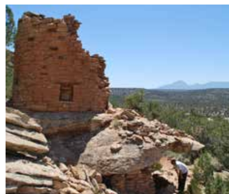
Painted Hand Pueblo

Built in the AD 1200s, Painted Hand Pueblo was a small village of about 20 rooms that still include faint rock paintings and petroglyphs. The designs of the ancient images have special meaning to Tribal descendants. In 2014, the Painted Hand Pueblo was placed on the National Register of Historic Places.