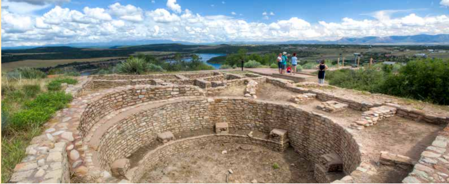
Escalante Pueblo, BLM Photo by Bob Wick