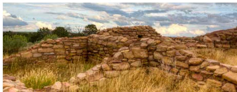
Lowry Pueblo

Dr. Paul S. Martin of the Chicago Field Museum of Natural History excavated Lowry Pueblo in the 1930s. In 1965, the BLM and the University of Colorado stabilized the masonry walls. In 1967, Lowry Pueblo was dedicated as a National Historic Landmark. Although the masonry was repaired for preservation and safety, Lowry looks much as it did when it was originally excavated.