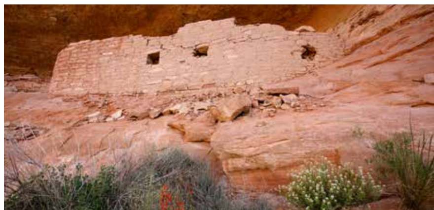
Sand Canyon Pueblo, Photo by ©Jerry Sintz

By AD 1275, Sand Canyon Pueblo was about three times the size of Cliff Palace (the largest pueblo in Mesa Verde National Park).