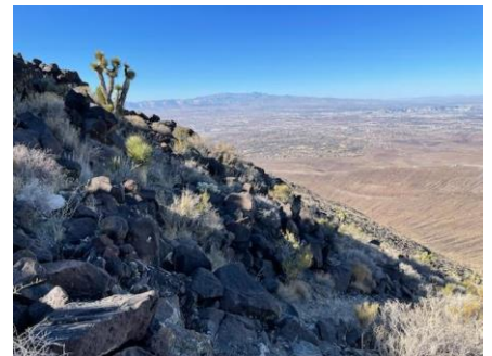
A scenic view from the top of Black Mountain.