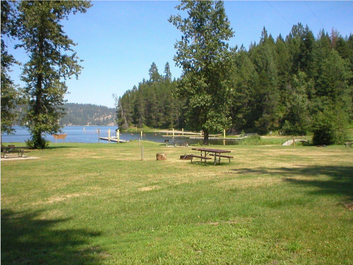
Figure 1: View of Mica Bay Boater Park