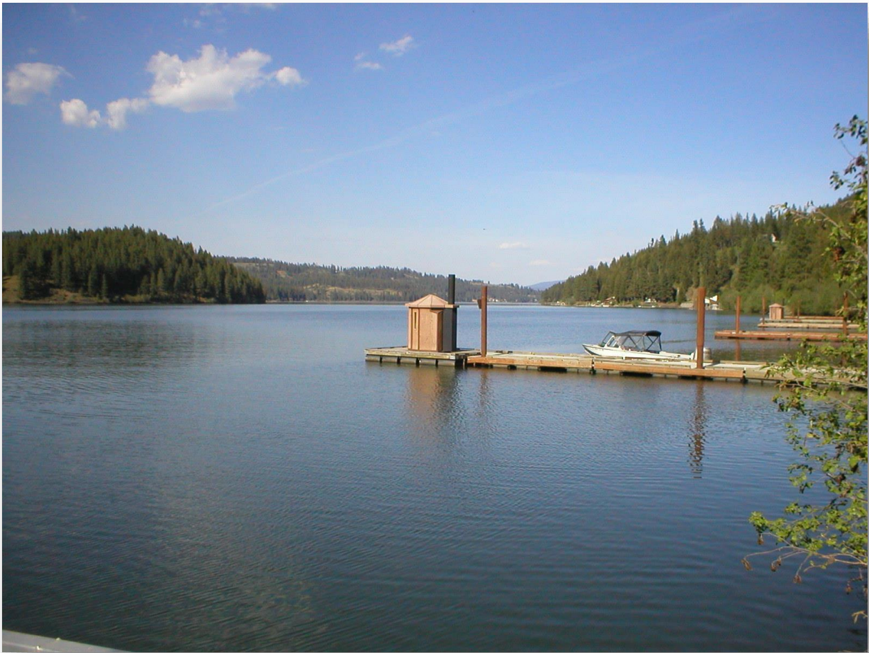
Figure 2: Docks of Windy Bay Boater Park