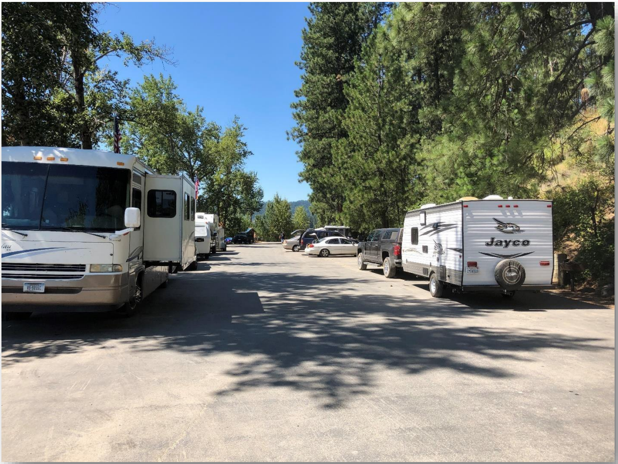
Figure 3: Killarney Lake Campground on a busy day