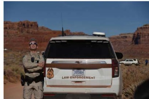
BLM employee views eclipse from Valley of the Gods Road