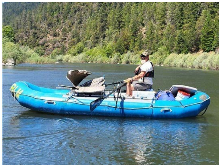
River Ranger Removing Trash from the Rogue