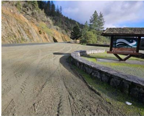
New Grading and Gravel at Hellgate Bridge Overlook