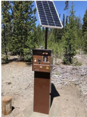
ROKs are now at Trout Creek and Mecca Flat CGs