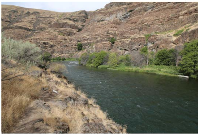
Lower Deschutes Wild and Scenic River