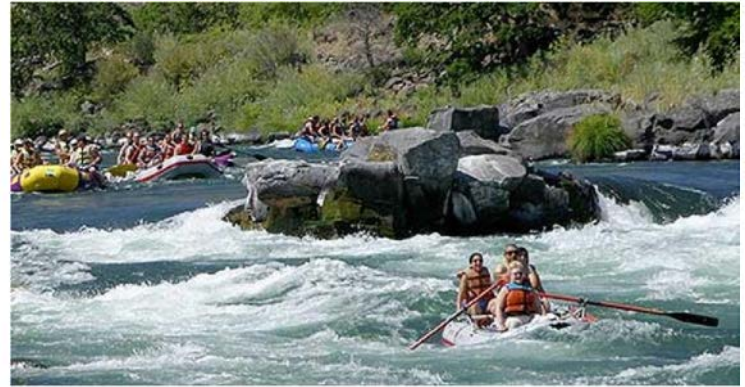
A busy day on the Lower Deschutes River