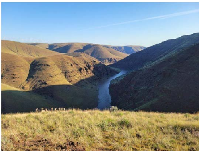
Sheep on the hillside above the John Day River.