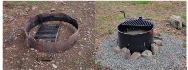
Campfire ring before and after ABA upgrades