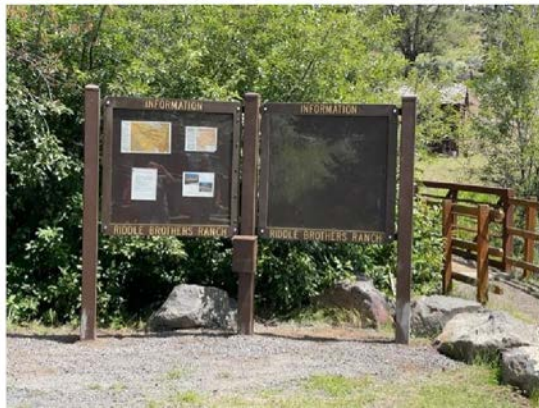
Riddle Brothers Ranch Informational Kiosk