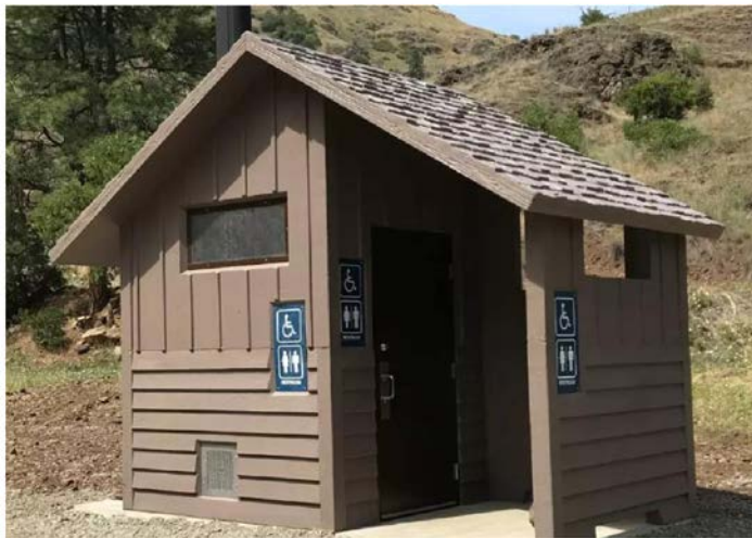
Shooting Range Vault Restroom