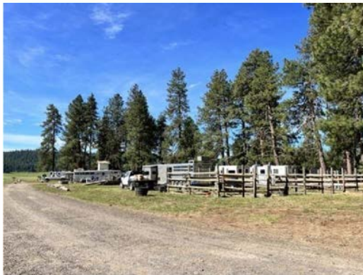
PCER SRP Monitoring

Annual SRP NEPA, issuance, and monitoring.