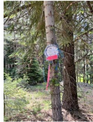
SRP Monitoring on Pacific Crest Trail

The Applegate Open is a 2-day hang gliding, and paragliding event held at Woodrat Mountain and is authorized annually under a special recreation permit(SRP). Event monitoring was conducted to ensure compliance with SRP stipulations and the National Environmental Policy Act (NEPA) analysis.