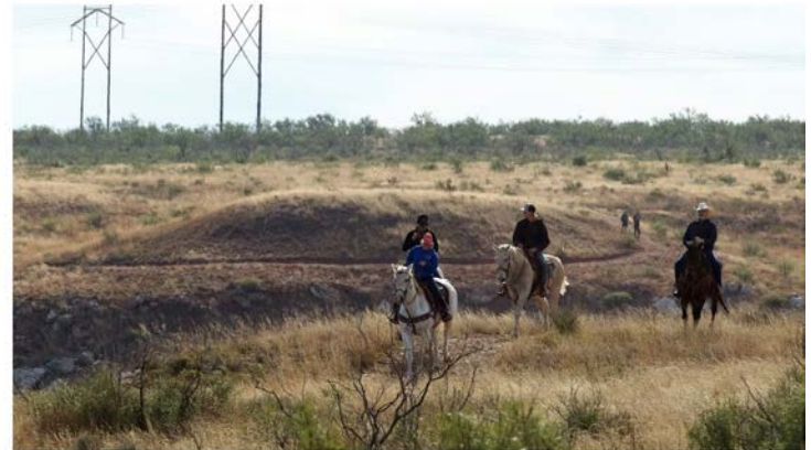
Cross Bar Multiple Use Trails