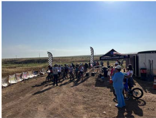
Mountain bike race on the Cross Bar SRMA