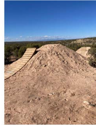
Calle Norte Bike Park Jump

The WeRock Grand National Rock Crawl event took place at Brown Springs the first weekend in September 2023. The permitted event is attended annually by an average of 1500 spectators and has resulted in the City of Farmington, in conjunction with the BLM and the Cliffhangers Jeep club, establishing "Jeep Week". Guided tours and rides are conducted throughout the week in the Glade Run Recreation Area Brown Springs OHV area.