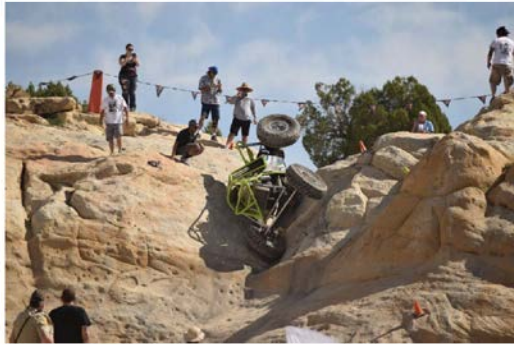
Extrem rock crawling machine navigating the course