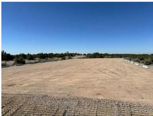
Hood Mesa Parking Lot - Site of Planned Pavilion

In fiscal year 2024 we intend to purchase several shade structures for Recreation Site development. One area that we plan to install a new pavilion is at Hood Mesa Parking Lot.