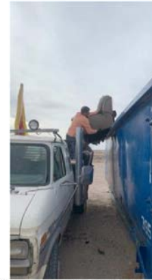
Clean-up at Nellis Dunes