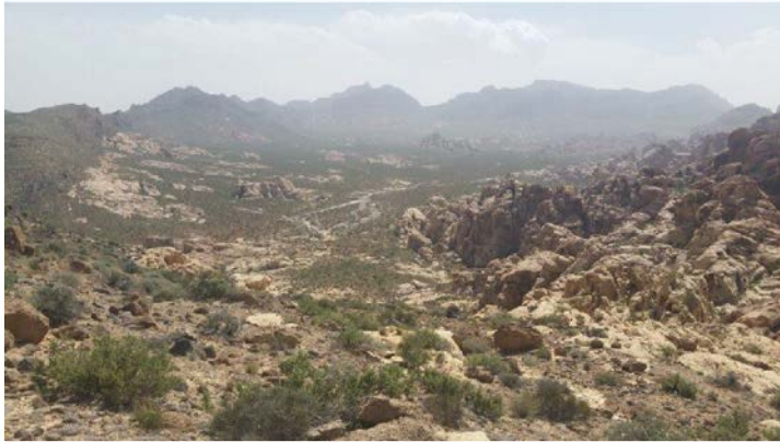
Muddy Mountain Travel Management Plan Area