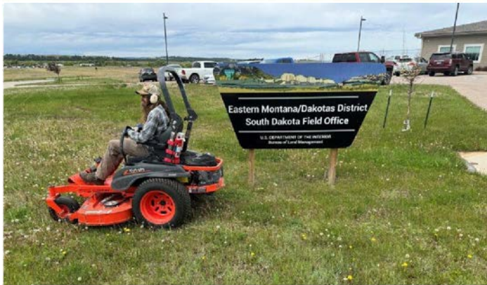
New zero-turn mower for the BLM Recreation Program