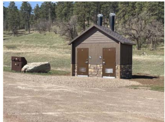
Fort Meade Recreation Area Maintenance