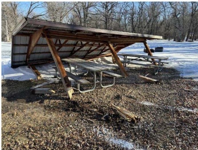
Picnic shelter damage.

Unfortunately, in Fiscal Year 24 the South Dakota Field Office will be using some of the funds collected to repair senseless acts of vandalism that occurred at the Fort Meade Recreation Area. In December, vandals destroyed four road closure gates, one kiosk, multiple sections of post and rail fence and a picnic shelter at the Alkali Creek Horse Camp. These repairs will cost $15,000 just for the supplies with the work being completed by BLM staff and volunteer organizations. In May, vandals also damaged the vault toilet at Fort Meade Reservoir, which will require painting, repairing bullet holes, reinstalling toilet hardware, and window replacements.