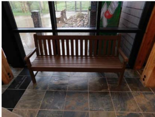
One of the new benches