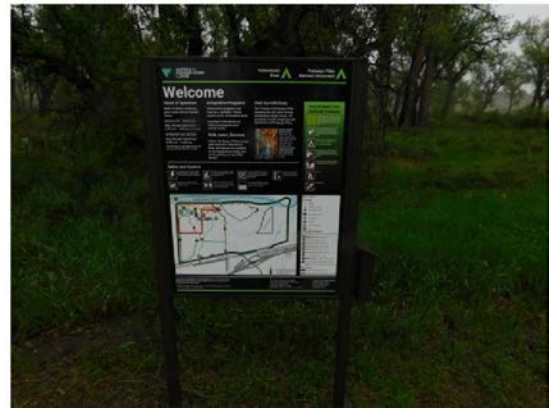
A new kiosk with updated information

Fee revenue was used to purchase six new benches for the inside of the interpretive center. These benches replaced older benches that didn't have a back rest. These benches fit nicely between the structural columns along the main hallway of the center to give visitors a place to rest and relax after exploring the monument.