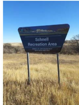
Schnell Entrance Sign

In FY23 a new riding lawn mower was purchased to replace an old mower which was breaking down resulting in increased maintenance costs and interruptions in site maintenance. In addition to the amount listed below the purchase included the trade in of two older pieces of equipment. The new mower will allow us to provide a quality and well kept campground for visitors.