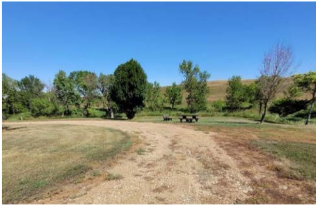
Schnell Campground Mowing