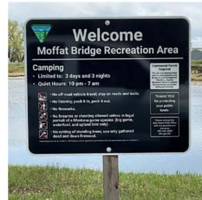
New Signage at Marias River Recreation sites