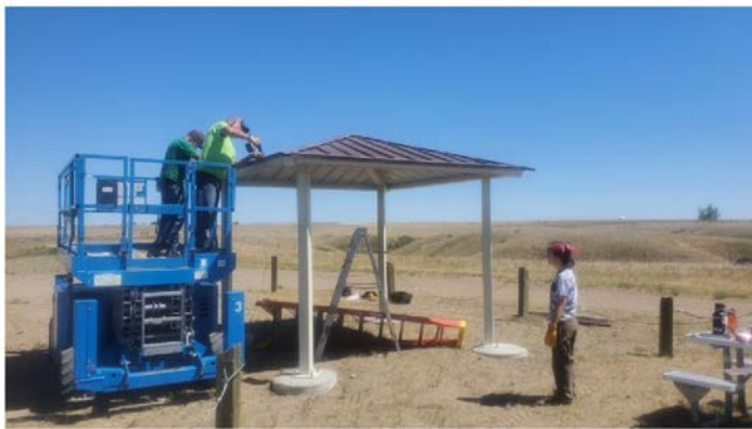
Assembling Picnic Structures

Soon, some exciting changes are planned for Paulo Reservoir. Three new picnic shelters are set to be installed, providing ample space for visitors to relax and enjoy their time in the great outdoors. Also, NEPA is underway for adding depth to Paulo Reservoir to benefit the fishery along with installing two fishing piers. These additions are expected to enhance the overall visitor experience and provide ample opportunities for outdoor recreation and relaxation. With these improvements, visitors can look forward to enjoying all that this beautiful location has to offer, and creating memories that will last a lifetime.