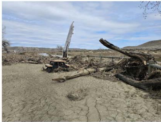
Cottonwood Flood Damage