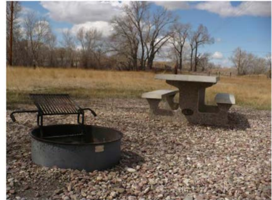
Lowry Bridge Recreation Site

The Lewistown Field Office (LFO) administers 30 Special Recreation Permits (SRP) for big game, fishing, and air shuttle services. Local, rural communities benefit greatly from the economic impact that the outfitter industry provides. By recognizing the value of the outfitter industry, LFO is supporting community values and promoting the quality of life that typifies Central Montana. In FY23, the Field Office did not utilize SRP revenue to administer the outfitter and guide permit program.