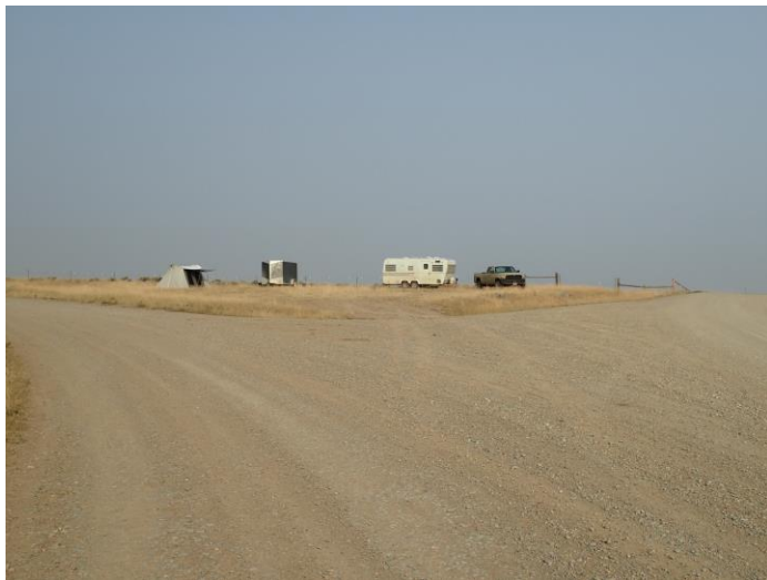
Welter Divide Dispersed Camping

The Musselshell River Breaks is a desirable area for the hunting outfitter industry. Through the revenue generated from special recreation permits from hunting outfitters, the Lewistown Field Office plans to install two vault toilets to promote human health and safety. Several BLM-permitted outfitters operate in these geographical areas where no restroom facilities presently exist. Evidence of human waste is noticeable at roadside pull-offs and dispersed campsites throughout the area. This project will also benefit the public need on a year-round basis. The Field Office has been saving previous fiscal year revenue to fund this project.