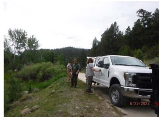
Montana Conservation Corp Work Crew

The Butte Field Office recruited 20 volunteers for the FY 23 season, who played a crucial role in maintaining the recreation sites and campgrounds. Volunteers assisted staff by checking in visitors, cleaning vault toilets, and answering public inquires. Additionally, they were offered the opportunity to take a Wilderness First Aid and CPR class, which provided essential training in backcountry medicine and methods for caring for people in remote areas, where medical care is often hours away.