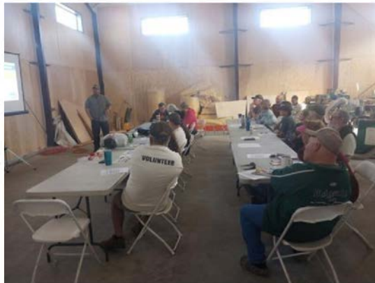
Wilderness First Aid and CPR training