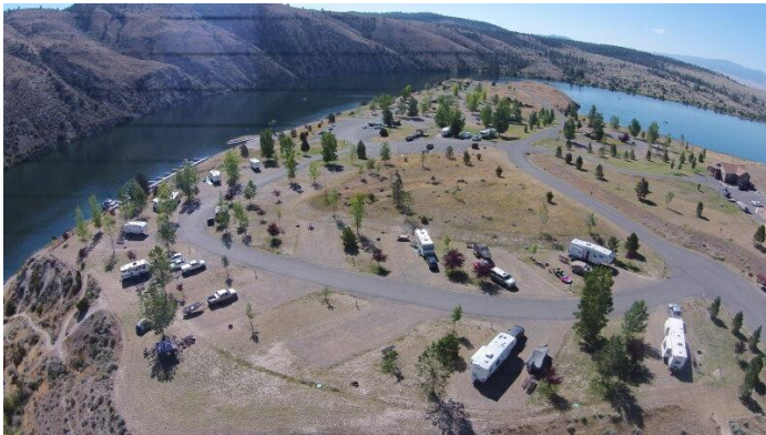
Devil's Elbow Campground

The following projects include contributed funds outside of 1232.