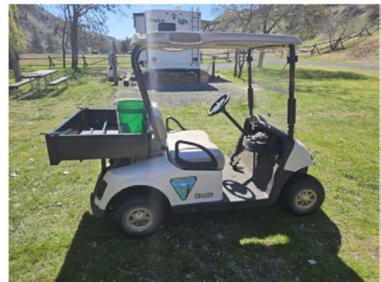
Golf Cart & Shed for Hammer Creek.