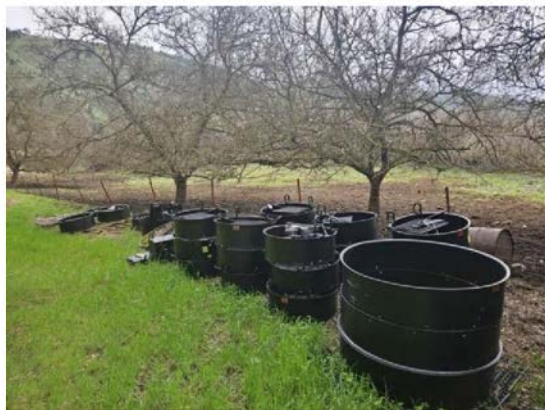
Fire Rings & Grills Ready for Installation.