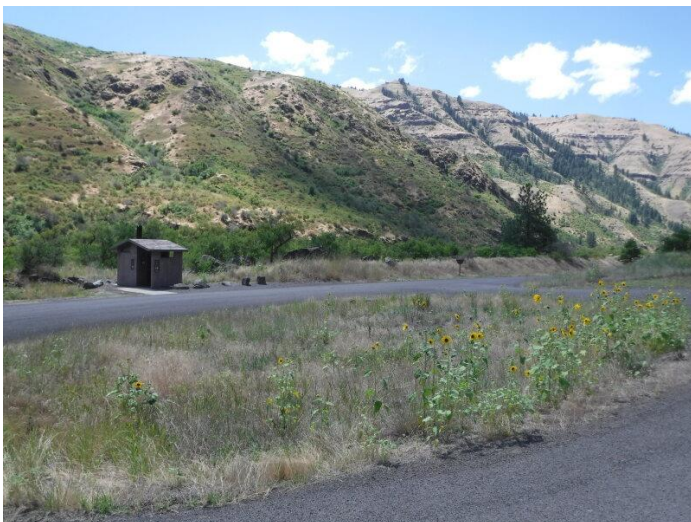
Improving and Expanding Recreation Infrastructure.

In FY2024, the CFO will contribute 15% of the 1232 accounts ($88,370.08) to support the goals and objectives of the Strategic Recreation Fund (SRF) for BLM Idaho. The SRF will allow field offices throughout the state to compete for Idaho State Park and Recreation Grants for improving and expanding recreation infrastructure.