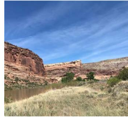
Cheatgrass is so Charming

Lots of work over the years has been completed to restore the riparian habitat. Hundreds of Tamarisk and Russian Olive trees have been cut and hundreds of acres of noxious weeds have been treated. The willows are coming back and we are planting new and wrapping existing cottonwoods to continue restoration efforts.