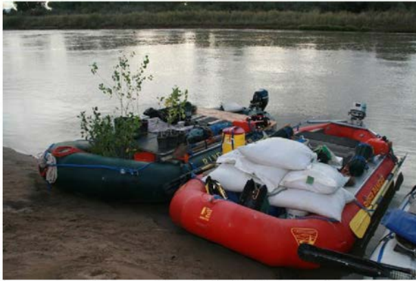
Transporting Baby Cottonwoods