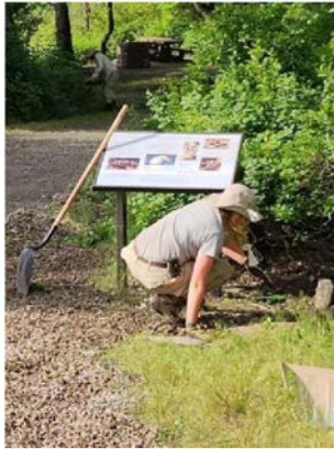
AmeriCorps participation at Pit River Campground