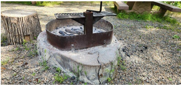
Deteriorating Fire Ring

Plans for FY2024 will continue focus on routine maintenance of facilities, campground, and day use areas.