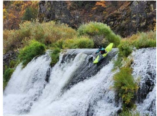
Kayaking the falls near Pit River Campground