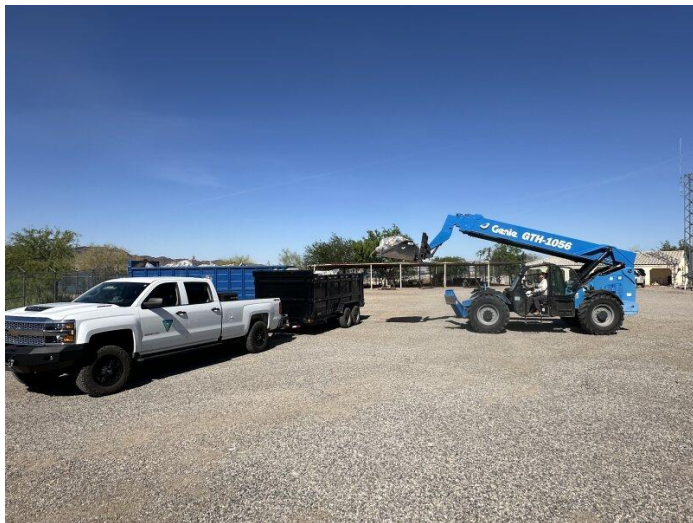
LHFO Maintenance Crew at Partner's Point

Lake Havasu Field Office planned activities for FY24 include continuing to support Park Rangers and additional staff for Park Ranger patrols on the shoreline sites of Lake Havasu, routine maintenance and repairs for the shoreline sites, Bullfrog Day Use Area, Crossroads Campground, and neighboring sites along the Parker Strip, as well as monitoring, preparing, and managing Special Recreation Permits for the Lake Havasu Field Office.