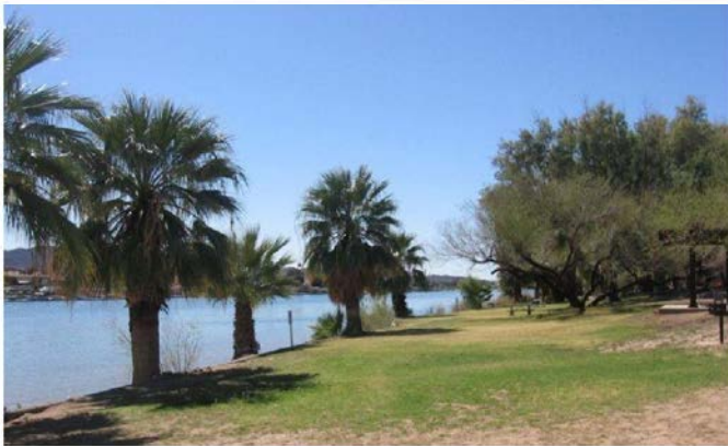
Bullfrog Day Use