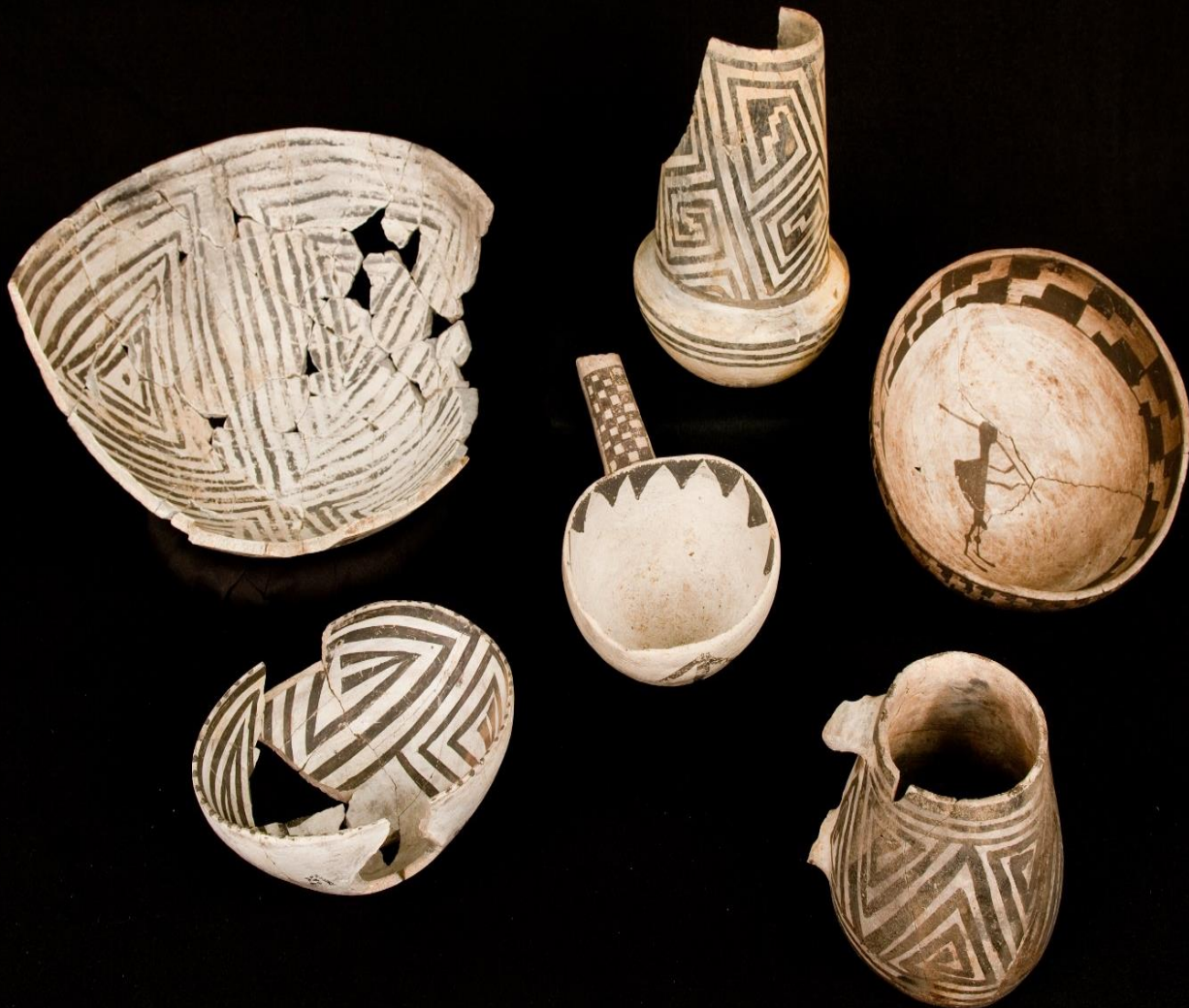
McElmo Black-on-white (AD 1075-1225) ceramic vessels in CANM collections.