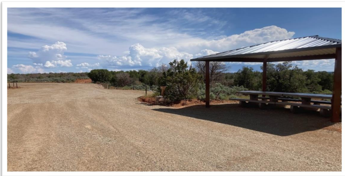
A new road, parking lot, picnic shelter, restroom, and interpretive trail were constructed at the Painted Hand Pueblo public site in 2023.