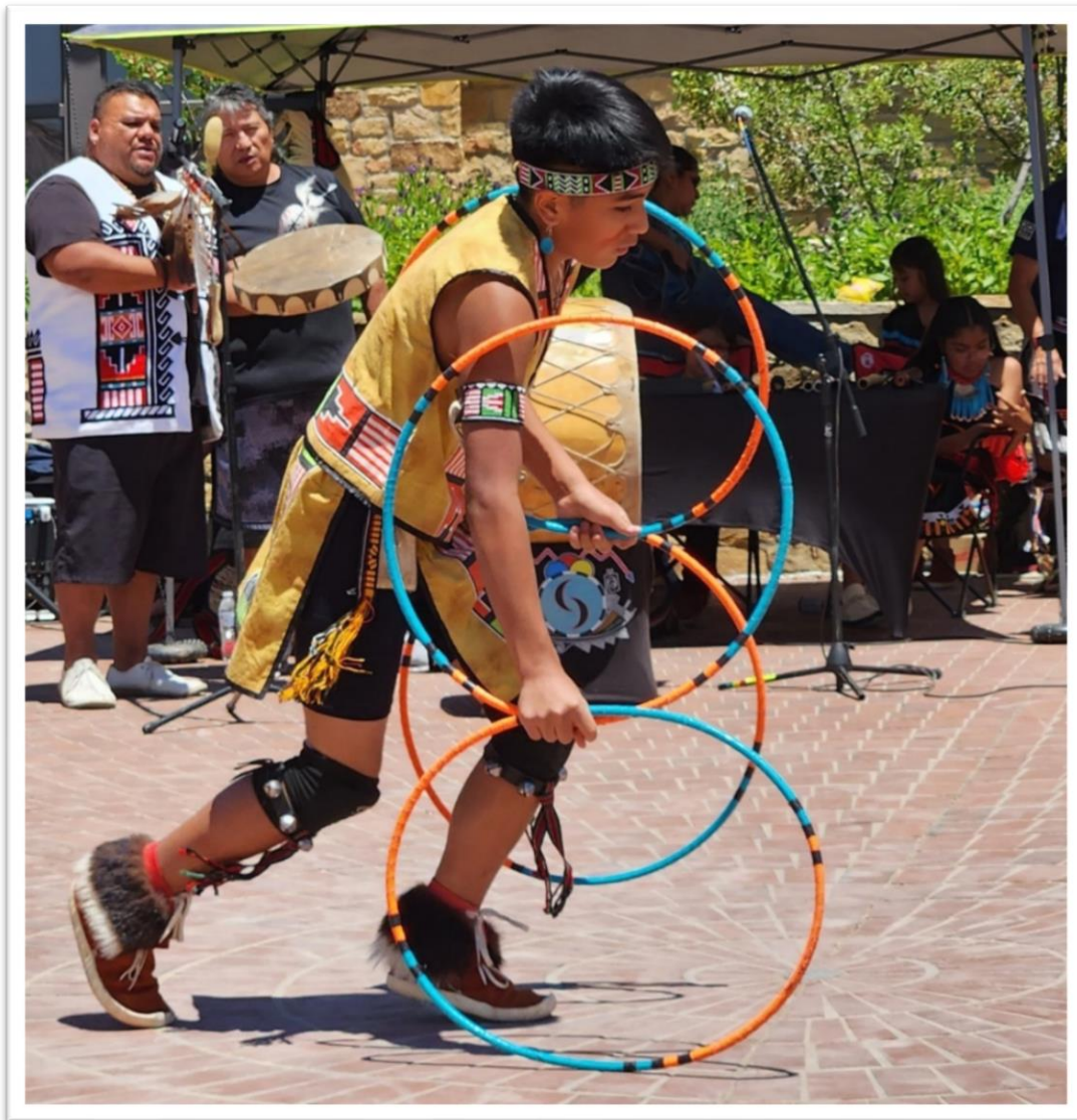
Maatuu Dancer, from Hopi Pueblo, at the Monument's first annual Indigenous Art Market.

CANM hosted its first Four Corners Indigenous Art Market at Canyons of the Ancients Visitor Center and Museum in partnership with SCCA. SCCA was able to hold the event on site as a fundraiser and process sales for the artists. BLM invited tribal members from the 26 Associated Tribes and Pueblos to host art booths, present cultural demonstrations, share cultural dances, and give lectures during which tribal members shared their truths and stories about the history of this landscape with the audience.