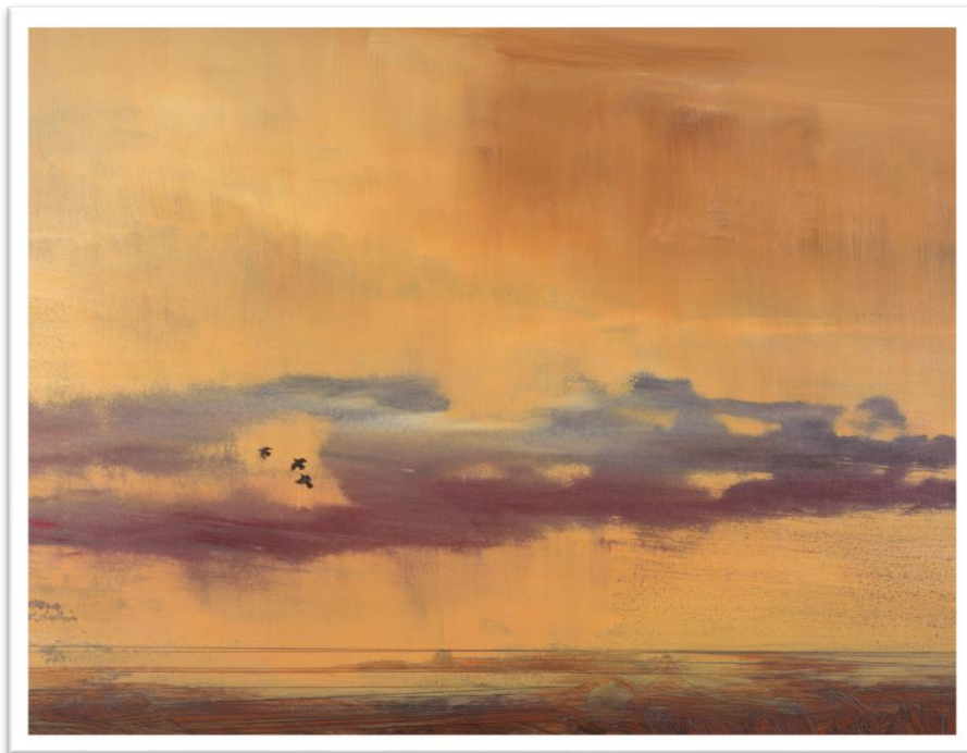
Spires by Stanton Englehart

Painted Hand Pueblo. Painted Hand Pueblo is one of 13 public cultural sites on the Monument. Prior to 2023, access to the site involved traversing a rough road that crossed private land. In 2023, the road was rerouted to public lands and improved. In addition, a new parking area, picnic shelter, restroom, and trail were constructed. The final phase of the project will be completed in 2024 with the addition of interpretive signs developed in partnership with Maryland Institute, College of Art.