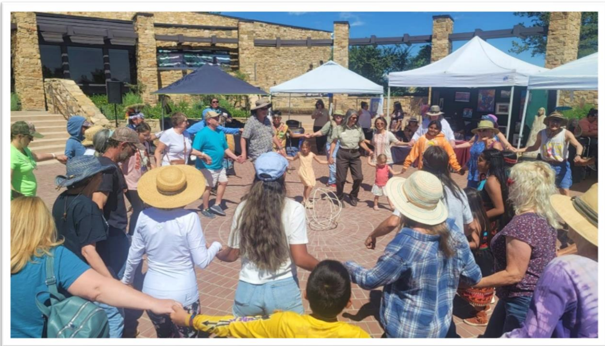
Members of the public participate in a dance circle during the Four Corners Indigenous Art Market.

CANM partners with SJMA to offer curriculum-based education programs to schools in and around Montezuma, Dolores, and La Plata counties. Together, 141 educational programs reached 1,365 youth in FY23.