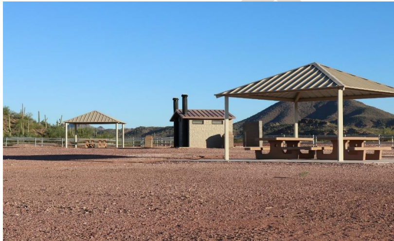
Figure 1: Facilities at Church Camp

Baldy Mountain is a developed recreational shooting sports site. It includes amenities such as a gravel parking area, gravel shooting platform, and long-distance fixed steel targets with developed backstops. The focused recreational shooting sports activity at this site is long-range rifle shooting. This approximately 1,440-acre developed recreation area is located approximately 2.4 miles north of State Route 74 and 2.5 miles west of Lake Pleasant via Castle Hot Springs Road, both of which are paved. The site has facility area which is approximately 13.5 acres. FY2023 had 5,021 individual recreational visits.