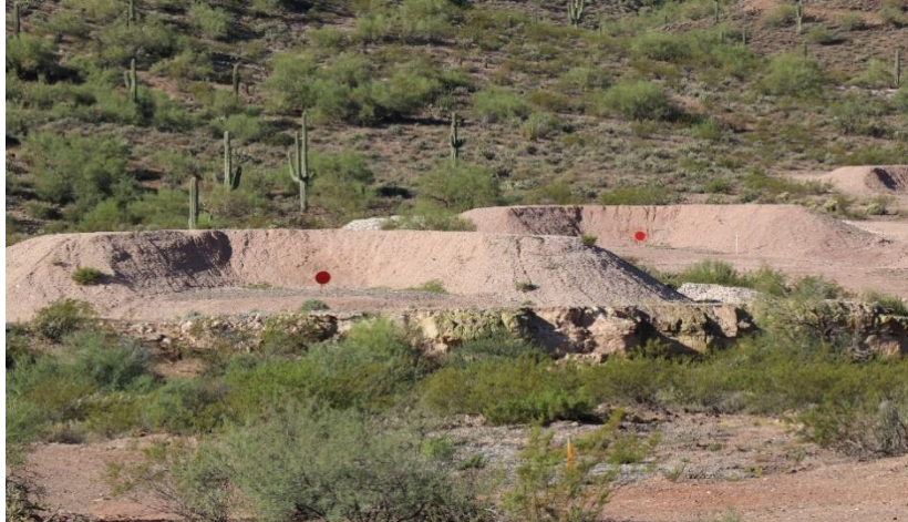
Figure 3: Targets at Saddleback Mountain