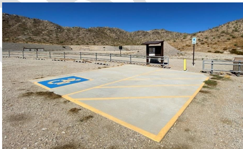
Figure 2: Box Canyon Range