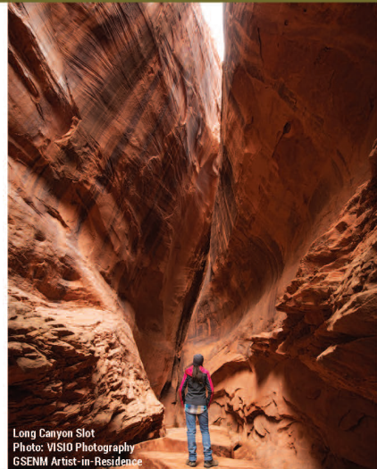
Long Canyon Slot Photo: VISIO Photography GSENM Artist-in-Residence