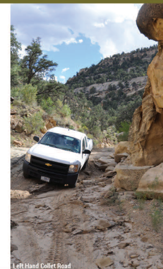
Left Hand Collet Road