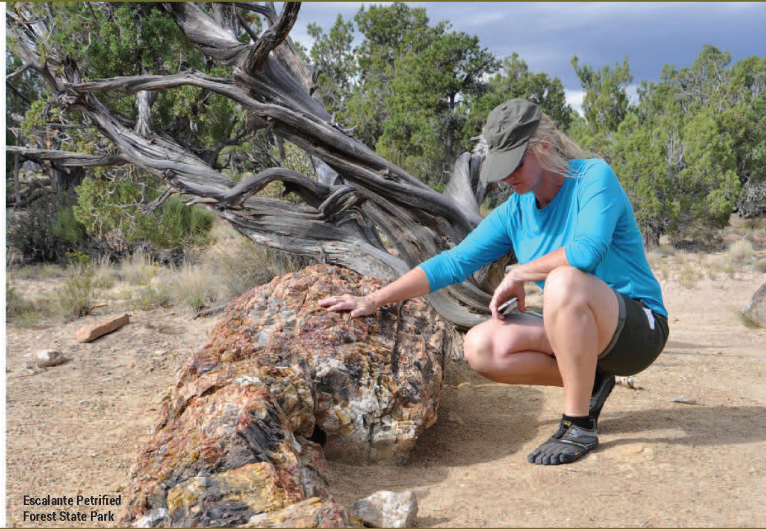
Escalante Petrified Forest State Park