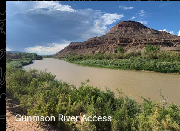
Gunnison River Access