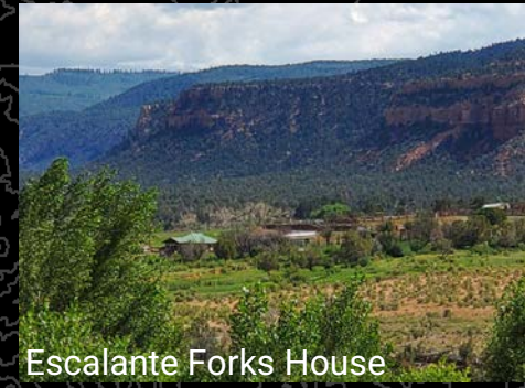
Escalante Forks House