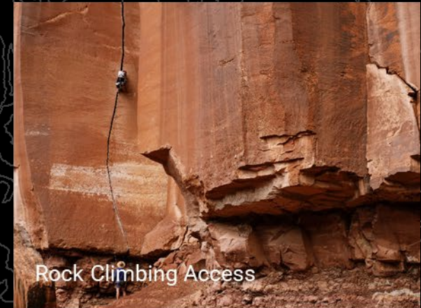
Rock Climbing Access