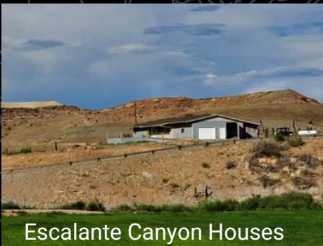
Escalante Canyon Houses