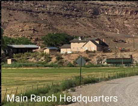
Main Ranch Headquarters