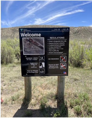
General Maintenance of Rec. Sites