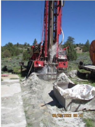
Water drilling rig actively working

Two campgrounds received new water wells, drilled for public users in the Encampment River Campground and Corral Creek Campground, both located in Carbon County. Previous wells were found to not be deep enough and did not make high marks for water quality. Fees collected from campgrounds over numerous years were put to work to pay for drilling these wells and associated costs with parts and some staff hours.