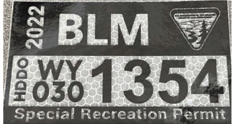
Boat Permit Sticker used

Fishing outfitters and guides use the North Platte River routinely and aggressively once ice has melted and BLM ramps are accessible for guiding activities. Boat permit stickers are used on both the vessel and trailer. These stickers are instrumental in identifying users with BLM permits, albeit on the water or at parking areas where trailers are left. Outfitters with authorizations in other field offices for operating, also use these stickers for compliance in those specific field offices.