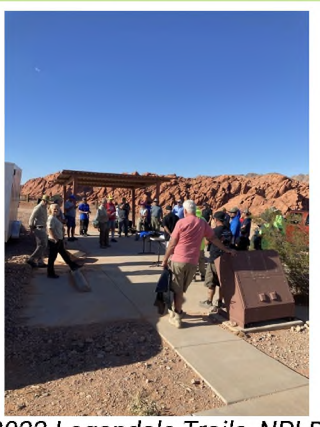
2022 Logandale Trails, NPLD

Las Vegas successfully conducted several clean-ups around the Las Vegas field office in Nellis Dunes National Off-Highway Vehicle Recreation Area, Coyote Springs, Lava Butte Road, and Logandale Trails. These events allowed hundreds of volunteers to clean up tons of trash from the desert, including boats, tires and cars. The recreation team staffed tables at multiple education / outreach events, such as National Public Lands Day, Hump N Bump, Nellis Air show Spring Fling, and the Spring Jamboree.