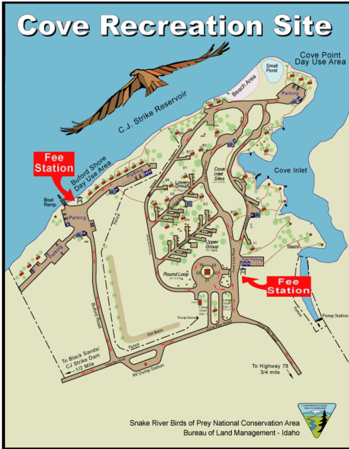
Figure 4: Map of Cove Recreation Site