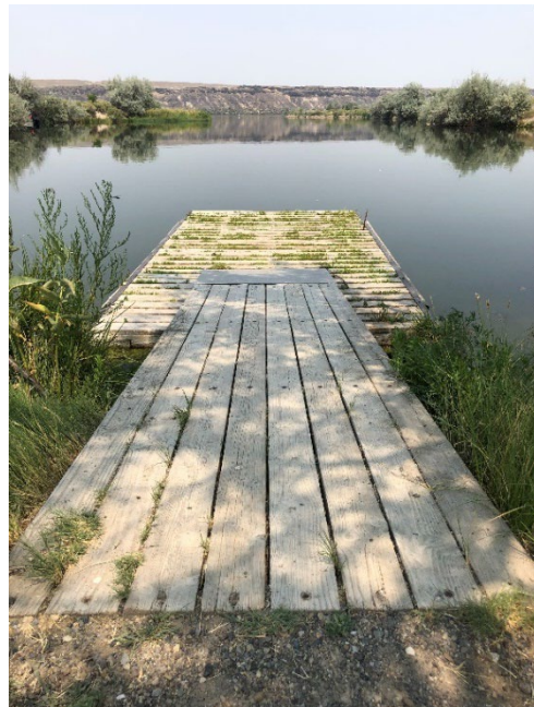
Figure 6: Aging boat dock