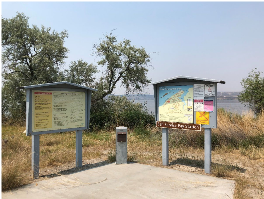
Figure 1: One of the two on-site, self-service pay stations.

This business plan provides a description of the fee site, the proposed fees for the site, associated operating costs, planned expenditures of fee revenue, a financial analysis utilizing a regional comparative market study of fees charged for other similar recreation facilities (see Table 5), and the impacts of proposed fee changes. The data used to analyze and prepare this business plan was obtained through internal BLM tracking mechanisms such as the Recreation Management Information System (RMIS), Collections and Billing System (CBS), and other locally generated recreation and visitor use tracking spreadsheets. As new solutions for collecting fees become available, these methods will be considered to better serve the public.