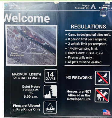
Dugway Campground Visitor Sign

The Rawlins Field Office is replacing four information signs at BLM campgrounds. BLM funded eight other signs pertinent to access and safety in FY21. However, with a vacant Outdoor Recreation Planner position for 90% of FY21, the placement of the signs had to be postponed to FY22. Over $3,000 was spent utilizing fee program funds for 12 signs. Sign cost can play a significant role in the decision process for sign replacement. One large sign alone can cost up to $3,000.