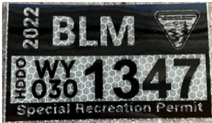
Rawlins Field Office Boat Permit Sticker

The Rawlins Field Office spent $900 in FY21 from fee program funds for boat permit stickers for Special Recreation Permit holders using the North Platte River for commercially guided fishing. Special Recreation Permit holder numbers vary in any given year; the RFO maintains roughly 25 SRPs for the North Platte SRMA. Vessels are required to have two stickers and one placed on the trailer. Boat permit stickers are used for monitoring and using data for the N. Platte SRMA.