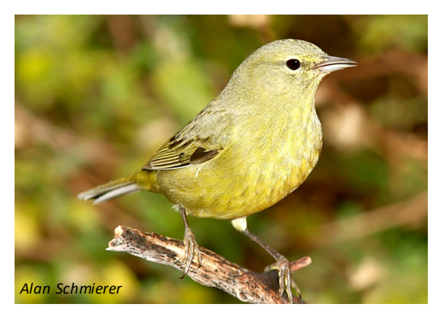
Orange-crowned Warbler A drab bird whose orange crown is hard to see. Look for its slim body and pointed bill. Song is a steady trill ending on a rising or falling note.

Tiny birds with a long, distinctive, multi-part song. Have distinctive white eye ring and constantly flit. Ruby crown is rarely visible.