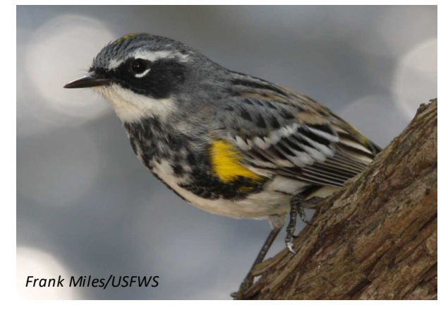
Yellow-rumped Warbler Usually the earliest warblers to arrive. Watch for the flash of their yellow rumps. Song is a sweet trill that speeds up towards the end.

Easily recognizable by its bright yellow color and dainty black cap. Song is a fast string of similar notes that drop down in pitch at the end.