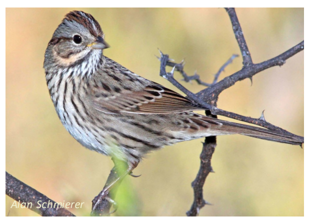
Lincoln's Sparrow Look for crisp streaking on its breast and two brown stripes on its head. Listen for a series of gurgles, buzzes, and trills.