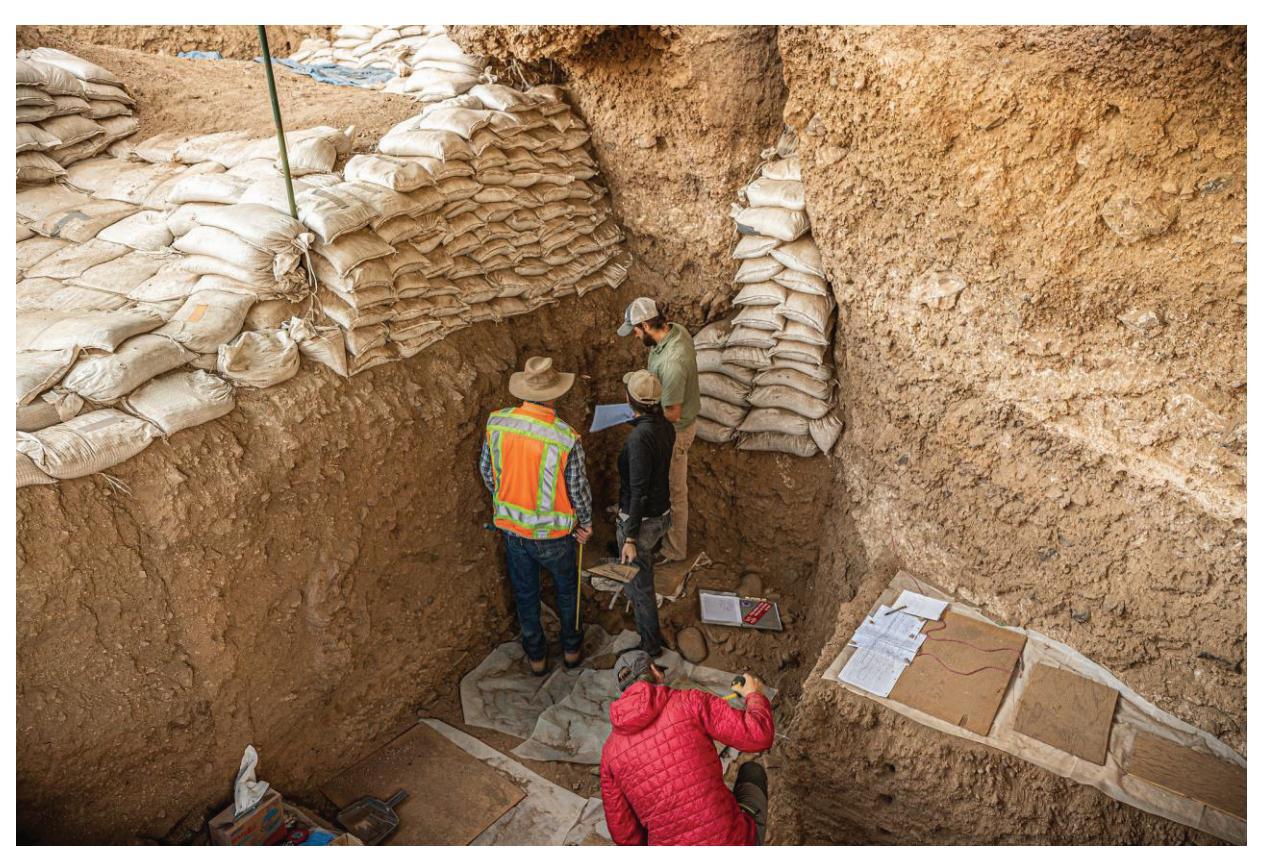
Archaeologists work at the Cave 5 excavation site, Connley Caves, on the last day of the 2019 archaeology field school, July 31, 2019.