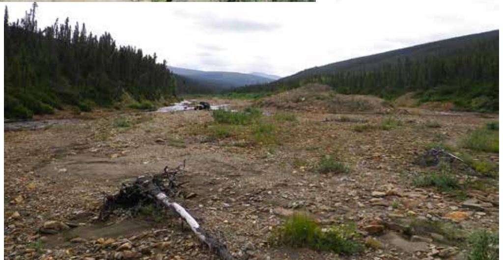
Photo showing lagging recovery timeframes, where full recovery has yet to be realized approximately 20 years after mining ceased (Bachelor Creek, Steese National Conservation Area).