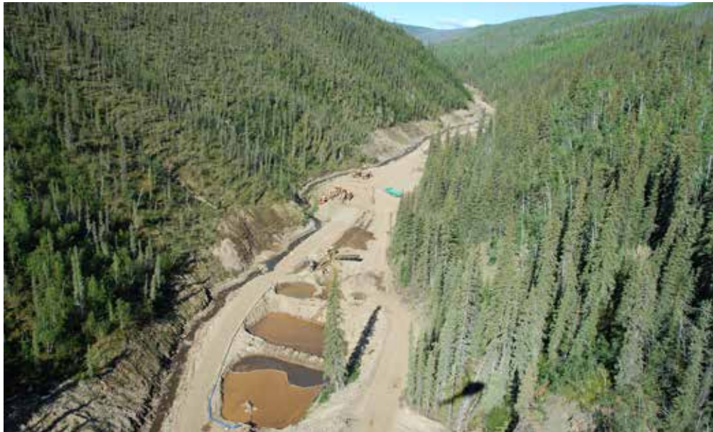
Photo showing watershed-scale disturbance within the floodplain (Franklin Creek, Fortymile Wild and Scenic River).

MESSAGE FROM THE PROJECT TEAM: This project addressed a fundamental management question that could not be fully answered with existing science and available data. BLM Alaska recognized the limited resources available and teamed up with the National Operations Center to facilitate data collection through the AIM Strategy's NAMF. The Eastern Interior Field Office's success has led to the development of a NAMF implementation plan for Alaska, which lays the foundation for statewide deployment of aquatic AIM and the integration of AIM-based objectives into resource management plans.