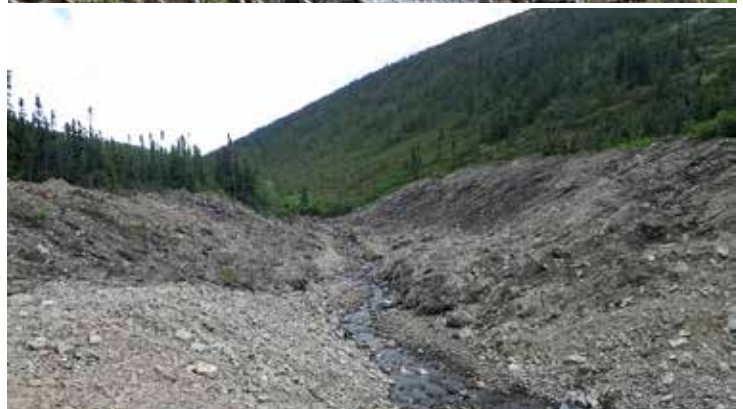
Comparison between unmined (top) and mined/reclaimed (bottom) conditions.