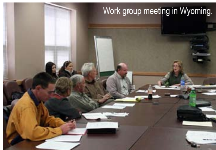
Work group meeting in Wyoming.

Identifying the issue or issues involved in a dispute is important in determining whether negotiation is appropriate. After initially assessing areas of disagreement, BLM managers may supplement their understanding of the issues by reviewing any history of conflict on the issues, considering expectations of the Bureau and stakeholders, and addressing ambiguity regarding the issues between potential parties. If the issues have been, or are being, litigated or appealed, BLM managers should coordinate with the Office of the Solicitor. It is important to determine whether any laws, regulations, court orders, or other mandates could constrain parties from attempting to resolve the issues at an informal level. Additionally, any party may prefer a more conventional forum, such as IBLA, for establishing new, or reaffirming existing, precedent. When a conflict resolution approach is appropriate, a BLM manager should consider circumstances such as the number of parties involved, the relationship between the parties, and how far the conflict or dispute has progressed to determine if a third-party neutral may be necessary. These considerations are further addressed below.