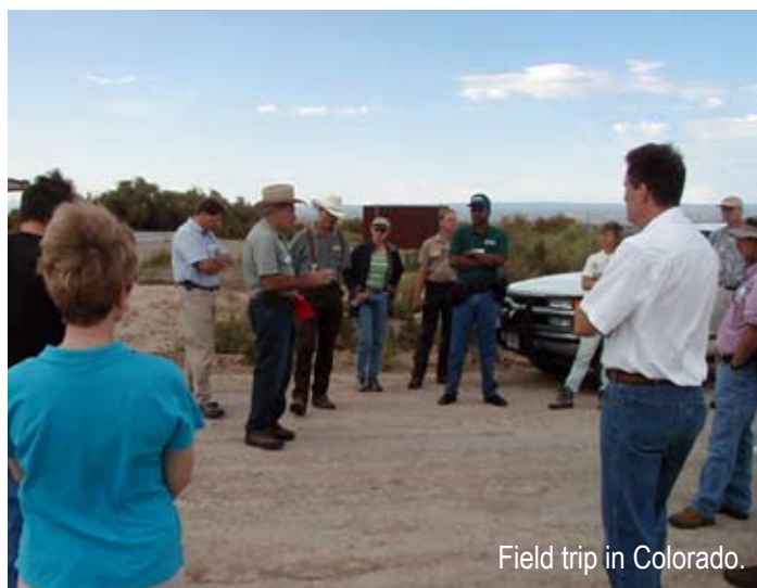
Field trip in Colorado.

Negotiation is one out of many available processes for the prevention, management, mitigation or resolution of conflict. The terms collaborative stakeholder engagement and appropriate dispute resolution (ADR) refer to a broad spectrum of “upstream” and “downstream” processes for preventing or resolving disputes outside the conventional arenas of administrative adjudication (protests and appeals), litigation, or legislation. In some cases, there may be overlap in both purpose and practice among the various processes. However, upstream collaborative stakeholder engagement processes are generally designed to prevent conflict from arising while downstream ADR processes involve managing and resolving an existing dispute, often with the assistance of a third-party neutral. (Please see the graphic at the back of this guide. The continuum depicted sets out parameters for upstream and downstream processes from conflict prevention through