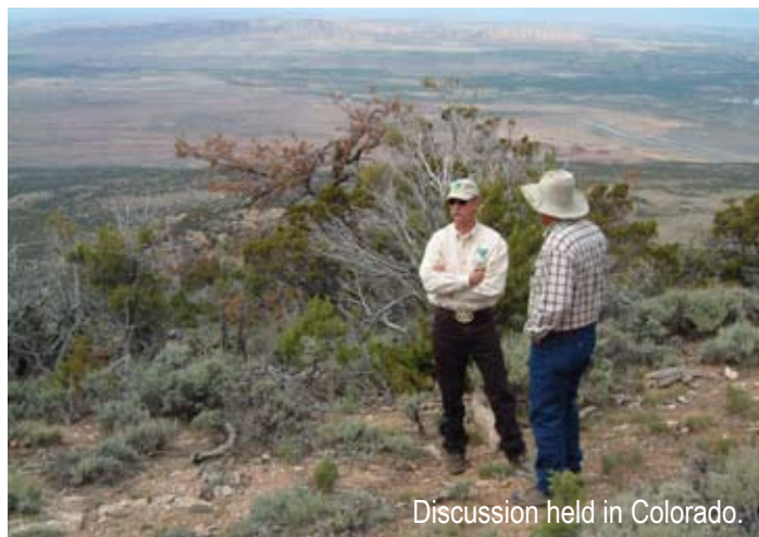
Discussion held in Colorado.

Once all stakeholders have been identified, the next step is to assess their potential interests and their likely goals in a negotiation. In some cases, a stakeholder's interests may not be clearly identified beforehand and can only be discerned during the negotiation process.