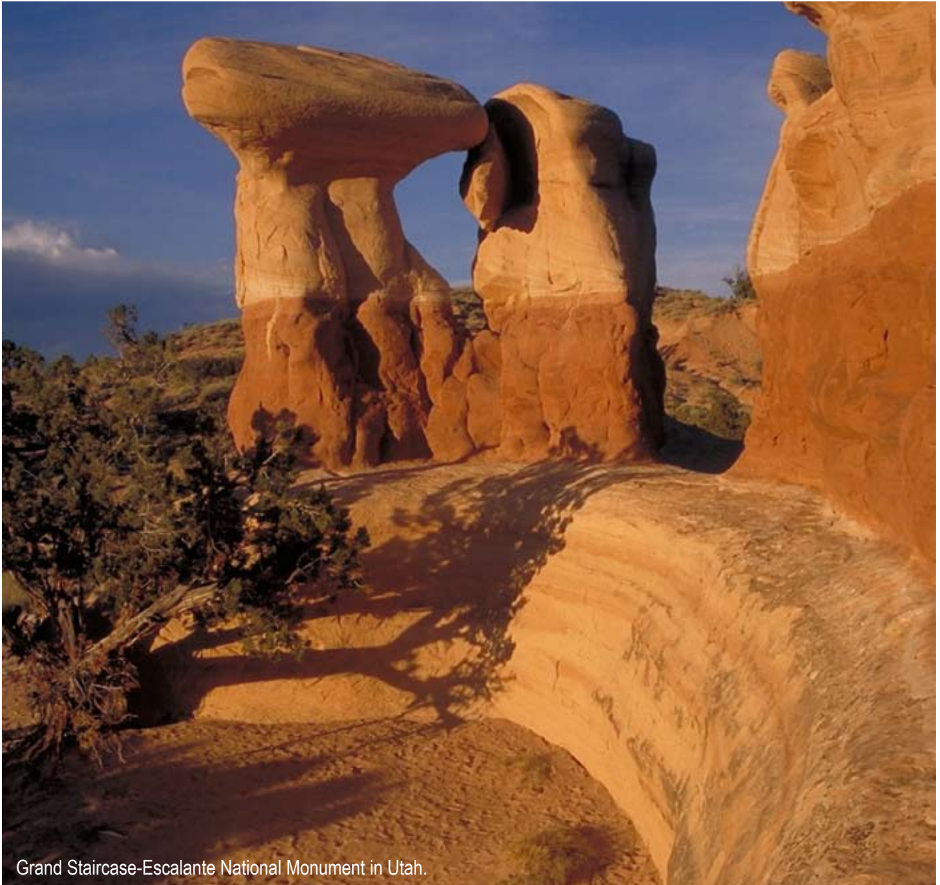
Grand Staircase-Escalante National Monument in Utah.

Commitment to an agreement can be further strengthened by formalizing it in writing.