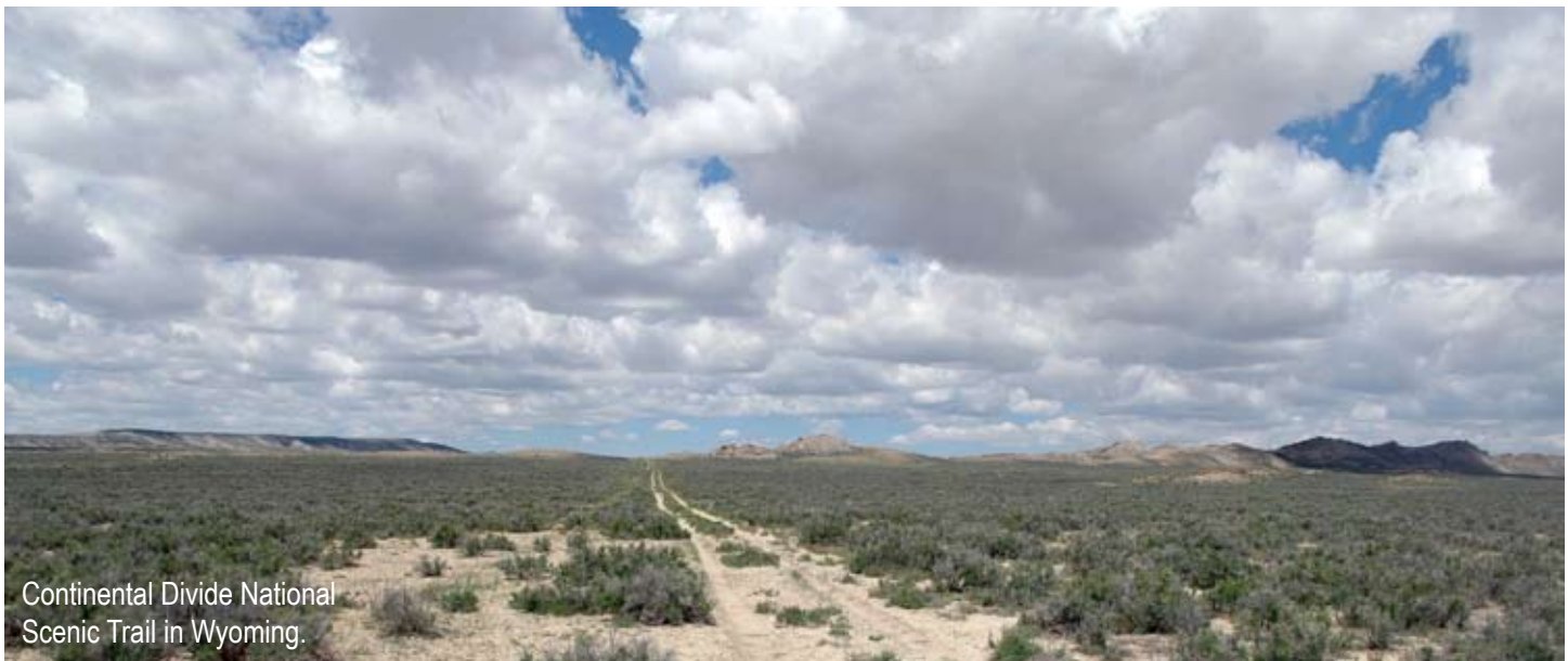
Continental Divide National Scenic Trail in Wyoming.