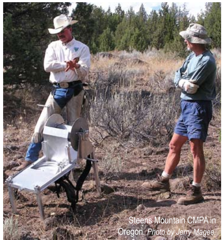
Steens Mountain CMPA in Oregon.

After brainstorming, the participants can objectively analyze the options which have been proposed. Considering all of the ideas generated in the previous step, participants should make note of those which are the most promising. Again, objective criteria should be used in evaluating potential solutions. Instead of judging options against preconceived positions, participants should consider how effectively the various options meet the interests of all parties and how feasible each would be to implement given external boundaries. Using these criteria, participants may work to further improve the most promising options.