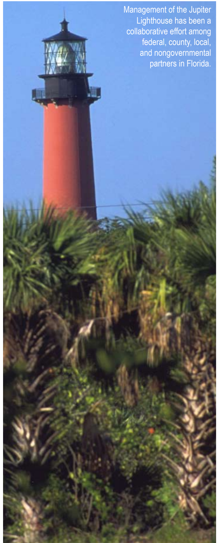
Management of the Jupiter Lighthouse has been a collaborative effort among federal, county, local, and nongovernmental partners in Florida.

Even parties with strong BATNAs have incentives to seek agreement through negotiation. As mentioned previously, an agreement that meets the needs of all stakeholders will have increased support for implementation on the ground and improve both relationships and future negotiations. Another benefit of negotiating is control. If a party's BATNA involves litigation or an appeal, there is always the possibility they will receive a less favorable outcome than expected. Parties who are informally negotiating with each other have the choice to accept or reject a proposed agreement, instead of having a solution imposed upon them. Thus, participants in a negotiation retain control over the outcome of the process. The certainty of an agreed upon solution may be worth more to a participant than potential gains from other alternatives.