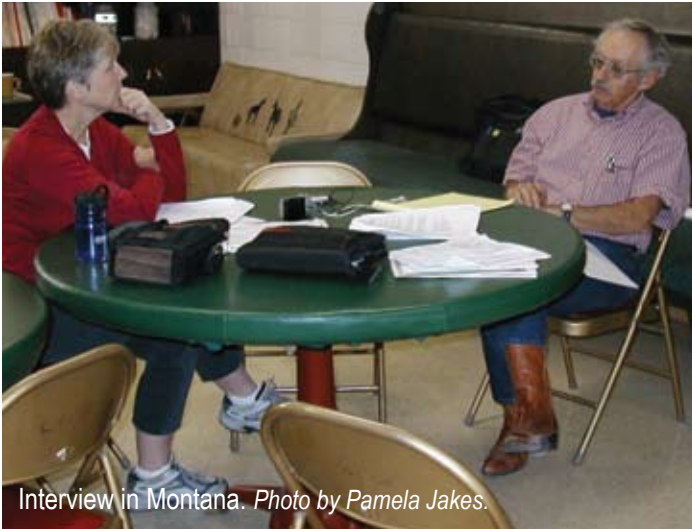
Interview in Montana.

Control in a negotiation refers to the balance of power between the participants “at the table,” but also to the relationship between those people and their larger organizations or constituencies. It is important to assess early where decision-making authority lies. For example, do the participants in the process have the authority to come to an agreement without first going to their constituencies or management for approval? (See also “Identifying decision-makers” below.)