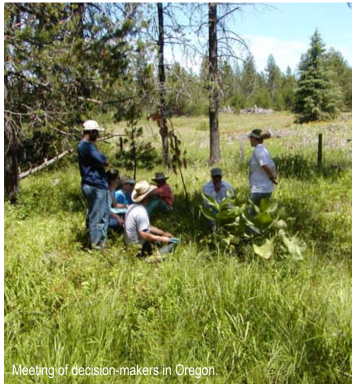
Meeting of decision-makers in Oregon.

The extent of each participant’s decision-making authority should be discussed at the outset. This includes explanations and analyses of position within agencies, organizations, and governmental bodies, and the existence of agency relationships. Once the decision-makers and their respective areas of authority have been identified, an agenda can be constructed using this information to outline decision-making points in the process. If appropriate, given the formality or complexity of a negotiation, an agenda may be written and distributed, but these procedural