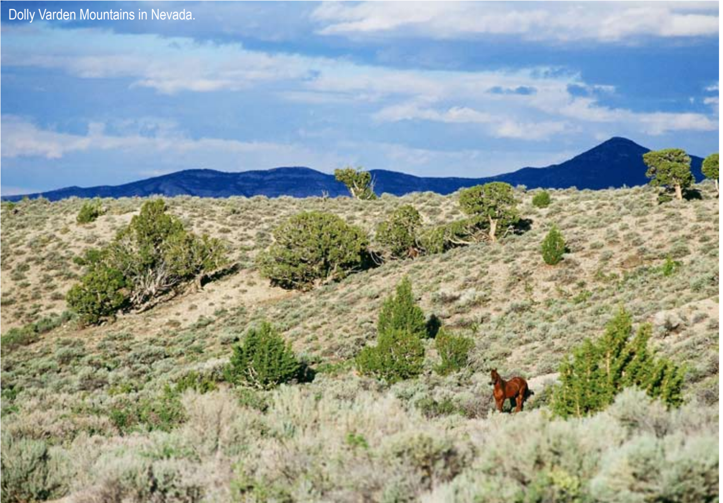
Dolly Varden Mountains in Nevada.

Selecting a mutually agreed upon method can serve to achieve buy-in among the parties and give legitimacy to the process. For the steps involved in a formal situation assessment, please see Situation Assessments available online at www.blm.gov/adr .