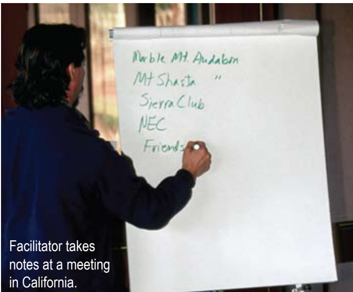
Facilitator takes notes at a meeting in California.

Asking certain questions can be helpful in shifting from conventional negotiation approaches to a more productive discussion of interests (e.g., “What is it about _____ that appeals to you?”), values (“Is _____ a high priority for you?”), and standards (“If we can accomplish _____ today, would you say yes?”). Open-ended questions help to get other participants talking and yield more information than pointed yes-or-no questions. Asking “why” and “what if” questions can often draw out underlying interests and help to steer the conversation away from positional bargaining.