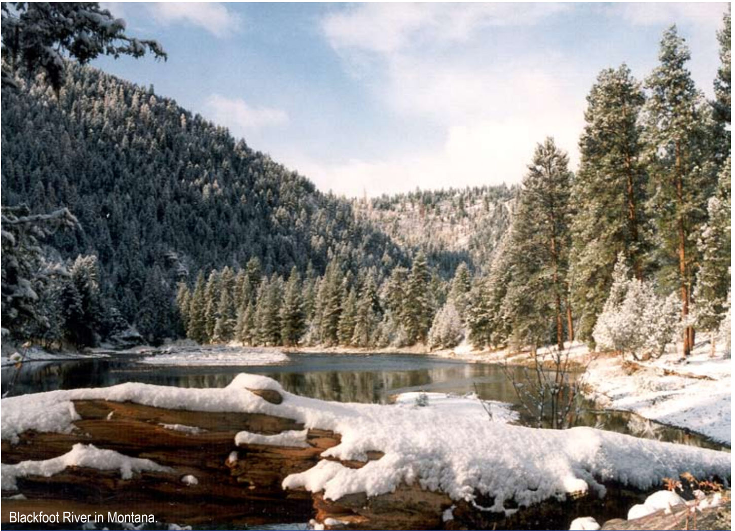
Blackfoot River in Montana.

Negotiation can produce agreements and resolutions efficiently, cost-effectively, and cooperatively.