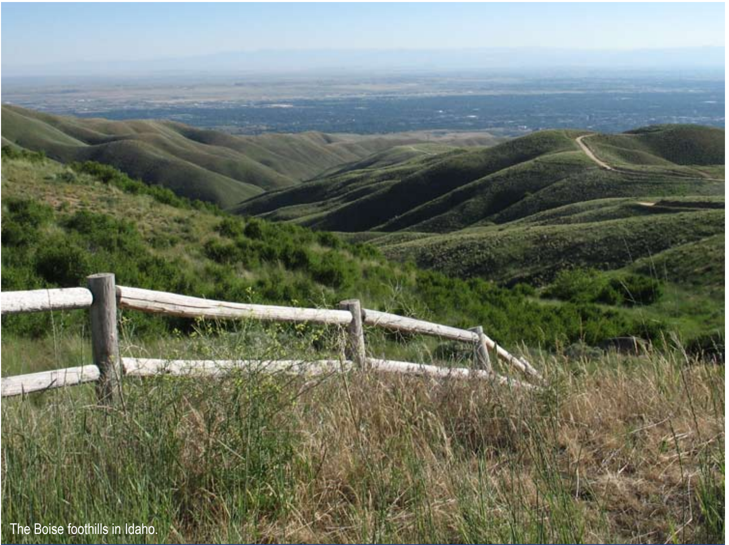
The Boise foothills in Idaho.

Negotiation is one out of many available processes for the prevention, management, mitigation or resolution of conflict.