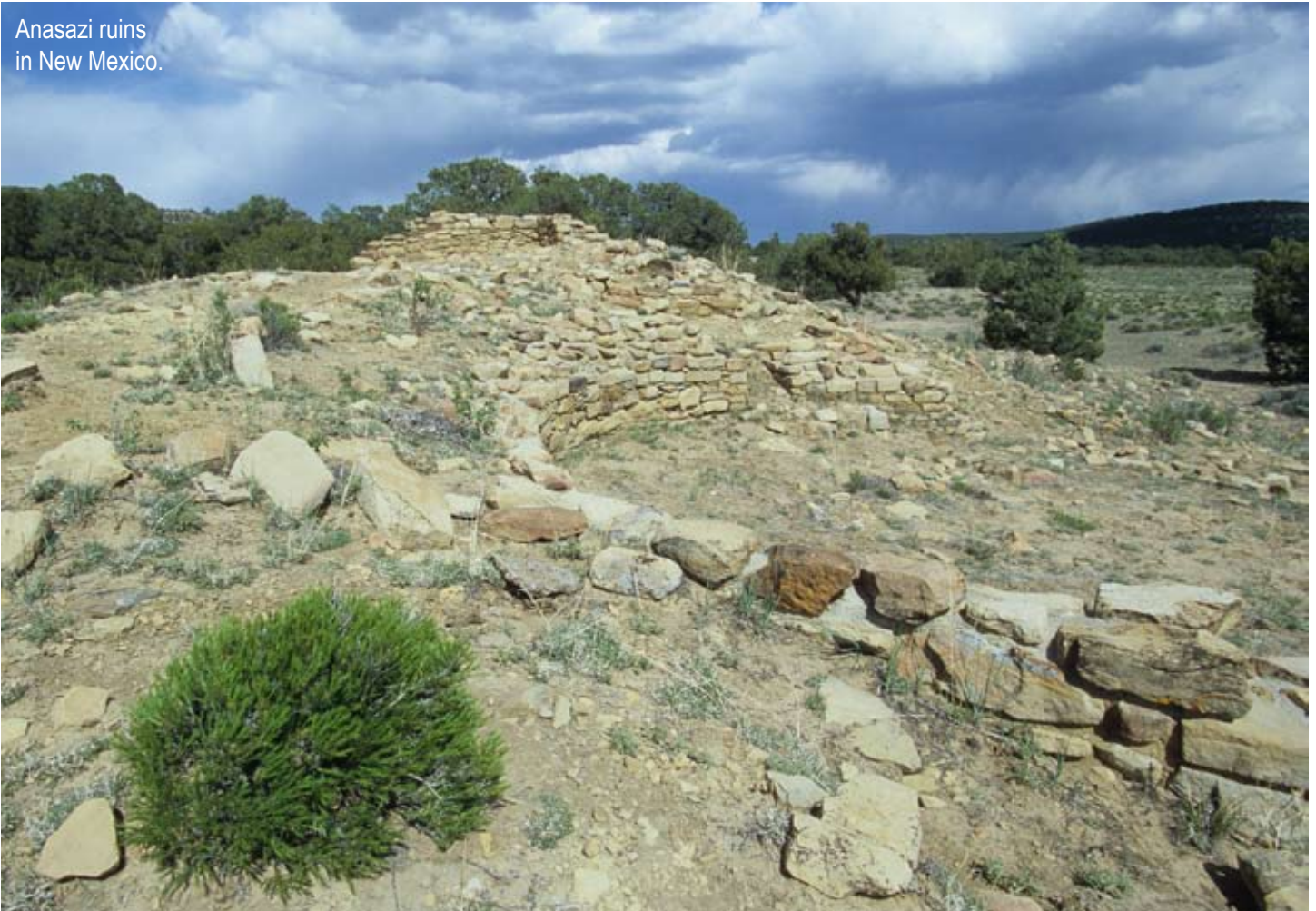
Anasazi ruins in New Mexico.

Each negotiation has its own unique procedural elements to be addressed, but common procedural decisions include questions of decision-making authority, issues of privacy or confidentiality, and definitions of agreement.