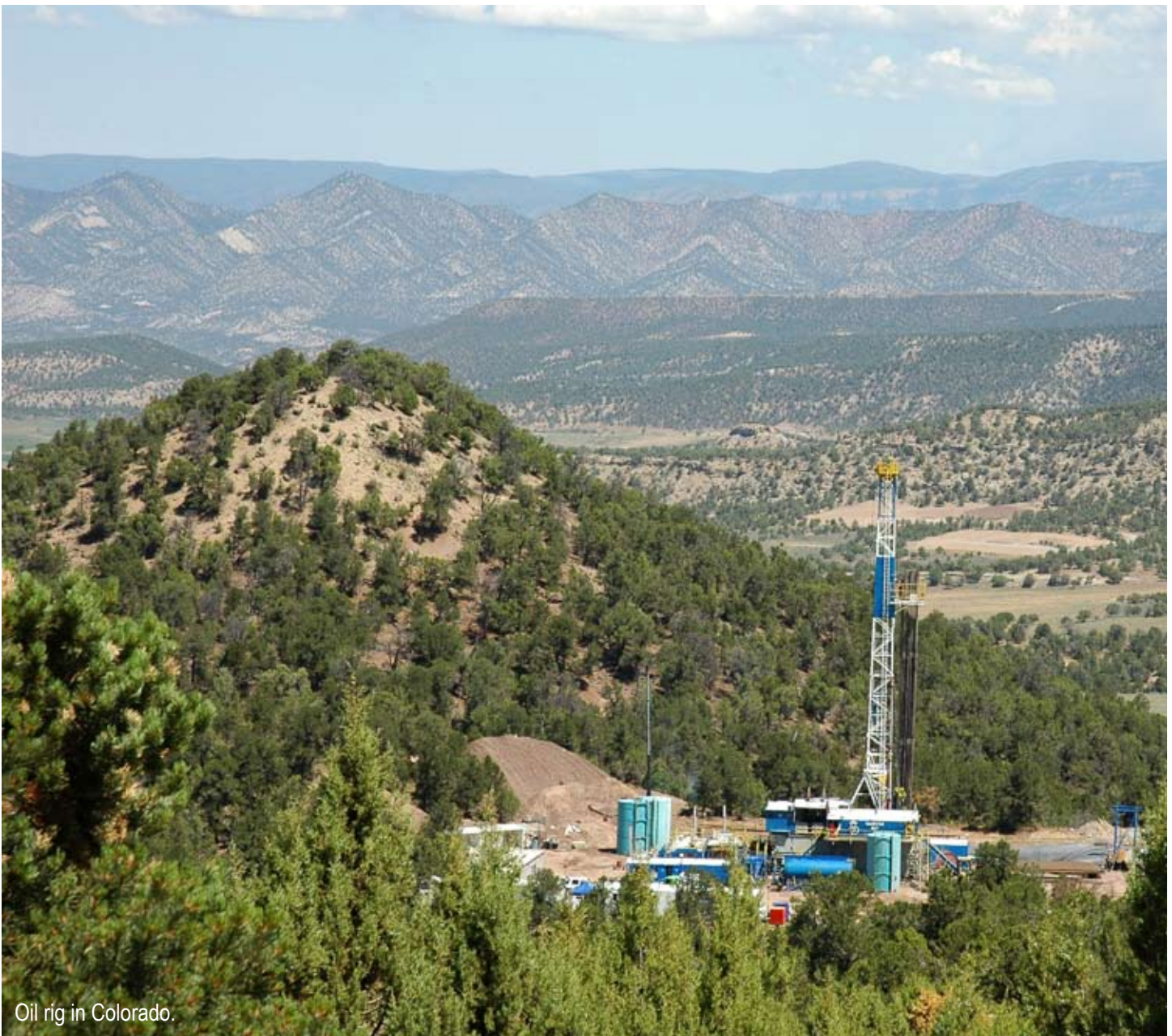
Oil rig in Colorado.

Review and Comments: BLM's ADR Advisory Council (ADR Manager-Advisors and Natural Resources ADR Advisors in each State and Center and in the Washington Office).