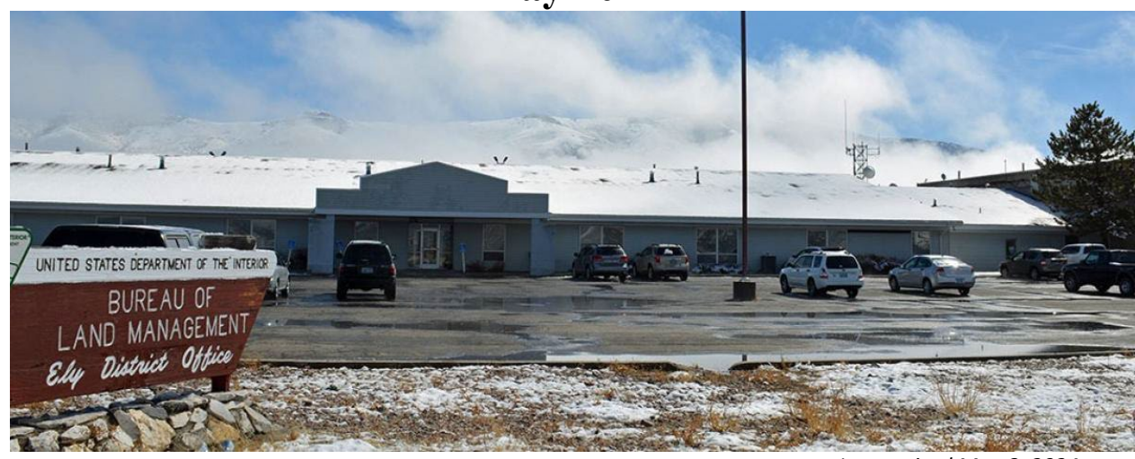
Last revised May 8, 2024