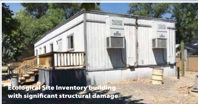
Ecological Site Inventory building with significant structural damage