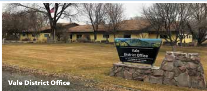
Vale District Office