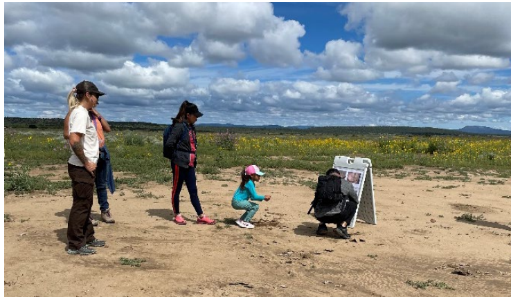
Interpretive program participants viewing images of petroglyphs found in the NCA.

Throughout FY22, El Malpais park rangers conducted several interpretive programs. One of the programs included information on petroglyphs, historic culture, and their tie to the landscape. Discussion also included message on leave no trace principles, recreation opportunities, and wildlife in the area.