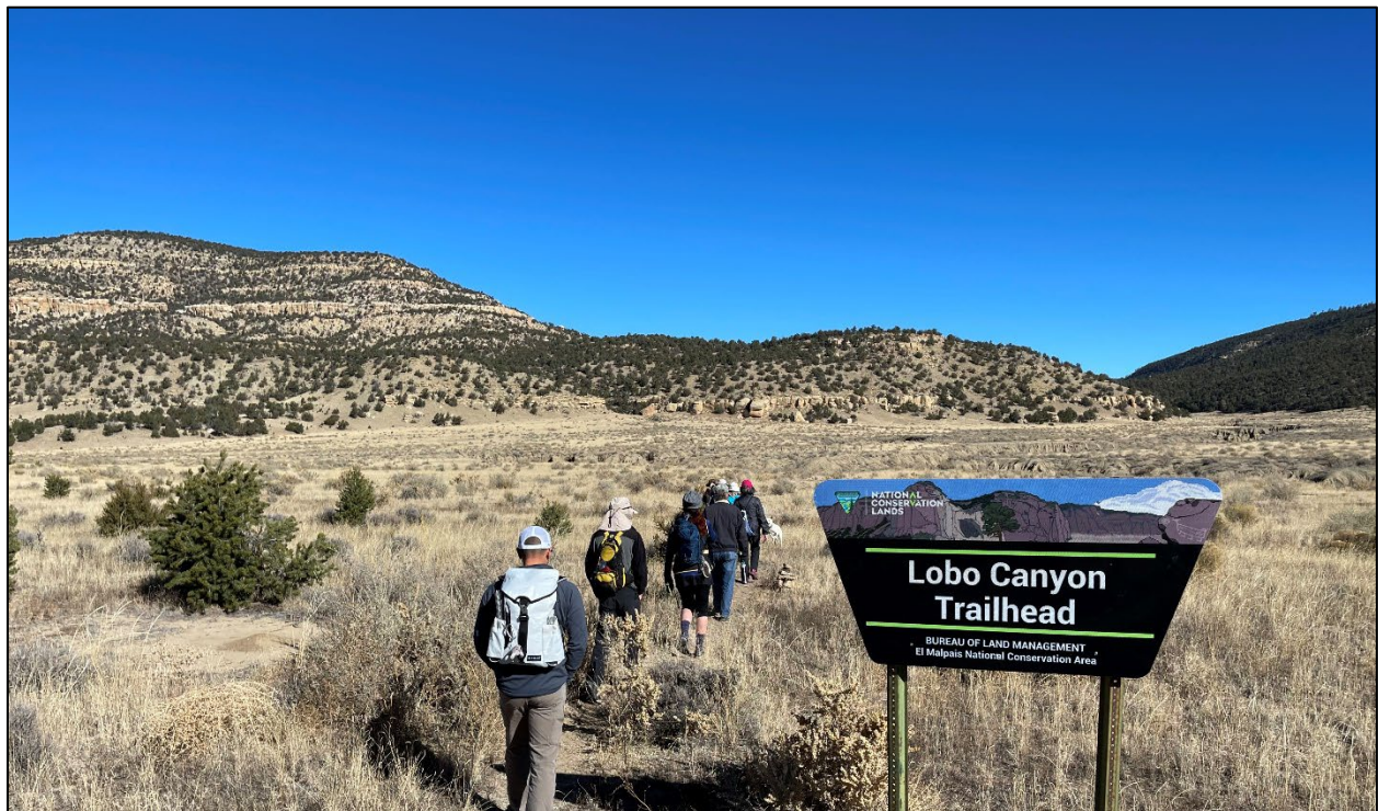
Visitors enjoy a Ranger-led hike to Lobo Canyon Petroglyphs.

As all units have experienced change in visitation throughout the COVID-19 pandemic, El Malpais staff have had to adapt their on-the-ground visitor interactions and facility maintenance techniques. To protect resources and prevent resource degradation, field staff is needed on the ground with the increased of visitation. Off-road driving and user-made campsites are increasing within the wilderness areas in the Conservation Area. The Conservation Area Park Rangers are a big part in stewardship outreach to public. A priority in FY23 is to fill a supervisory park ranger position to assist with El Malpais' day-to-day operations and two seasonal park ranger positions. Interpretive programs have been minimized throughout the past three years due to COVID-19 and FY23 allows the continued opportunity to create more in-person ranger-led visitor experiences.