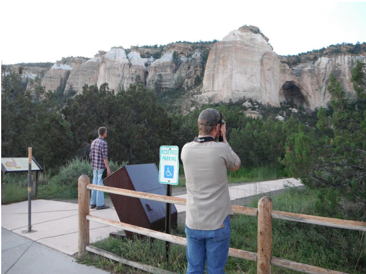
Visitors enjoy an early morning hike at La Ventana Arch

In FY22 the El Malpais NCA Ranger Station has been open three days per week (Friday through Sunday) and has received steady visitation throughout the year. The Ranger Station received 1,787 visitors and the overall El Malpais NCA received 213,814 visitors in FY22. Historically, visitor use numbers recorded in the database are collected through a variety of methods including estimates made by recreation staff based on data from the nearby National Park Service's El Malpais Visitor Center and El Malpais' special recreation permits. Recreation staff deployed new TRAFx vehicle counters in FY21 with more installed in FY22. In the Recreation Management Information System (RMIS), the past estimated annual visitation reported was less accurate than data that TRAFx counters now provide. Visitation in the NCA is steady throughout the year with the highest overall use from spring to summer. Elk and pronghorn hunting are popular in the Conservation Area with open seasons from August through December. BLM expects that visitation to the Conservation Area will continue to increase over the years due to population increase and increased interest in outdoor activities.