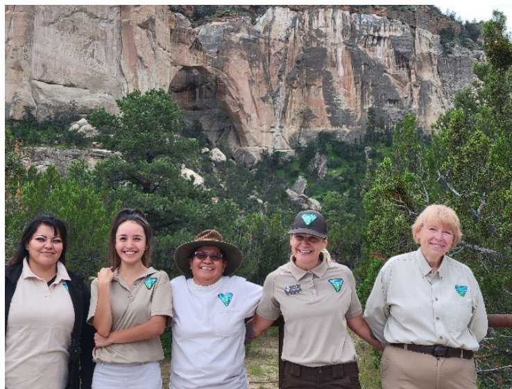
Conservation Area Volunteers with Park Ranger at La Ventana Natural Arch.

In FY22, the Conservation Area hosted five volunteers whose hard work and efforts contributed to memorable experience for visitors. Volunteers worked on trail and facility maintenance, and vegetation removal in the developed recreation sites and at the Ranger Station.