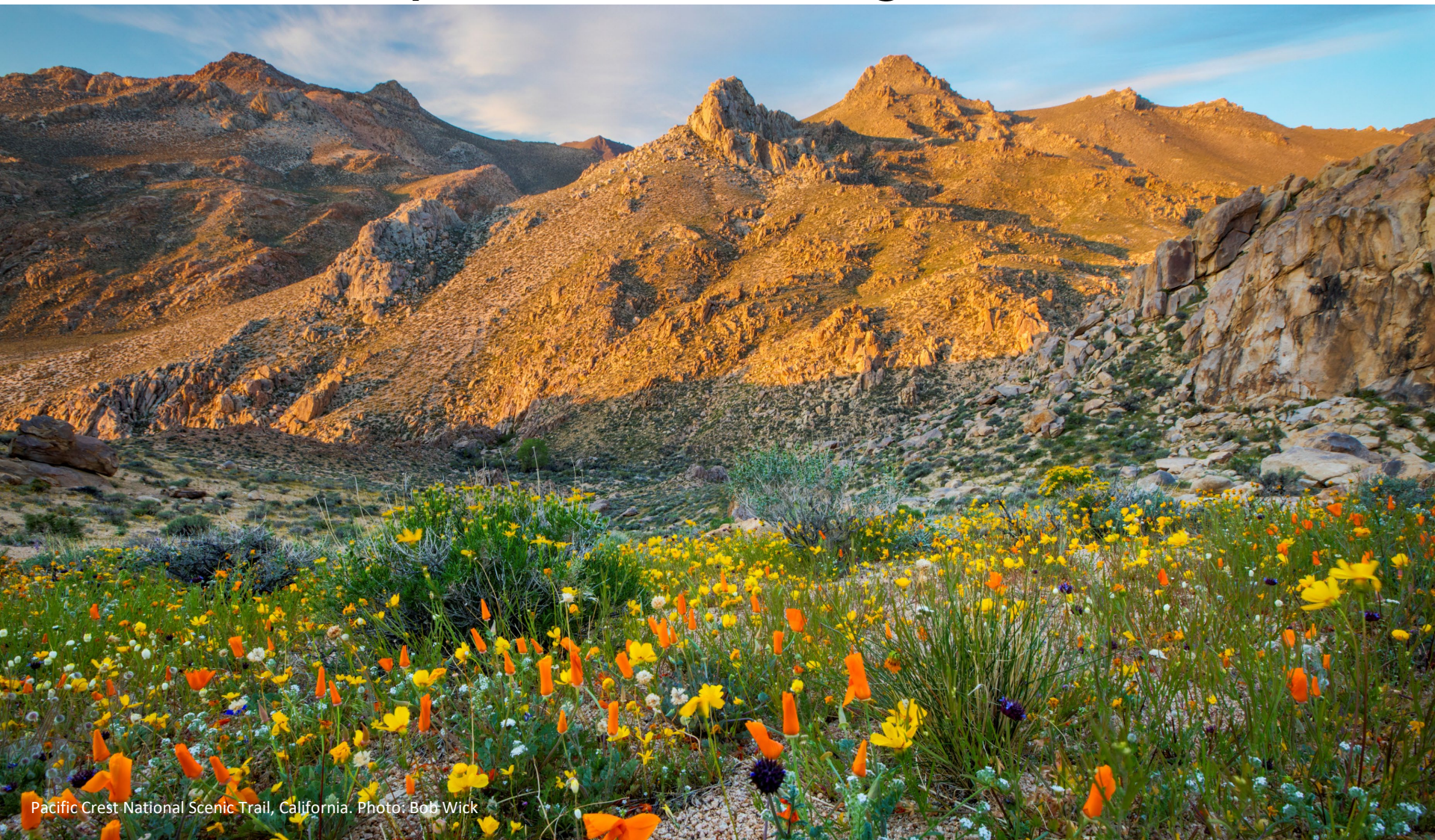
Pacific Crest National Scenic Trail, California.