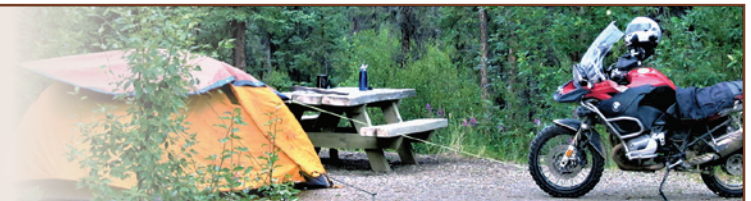
Marion Creek Campground/BLM

The BLM hauls approximately 20 tons of litter from the Dalton Highway back to Fairbanks (the nearest landfill) each year. Please help reduce waste and litter by packing out everything you pack in.