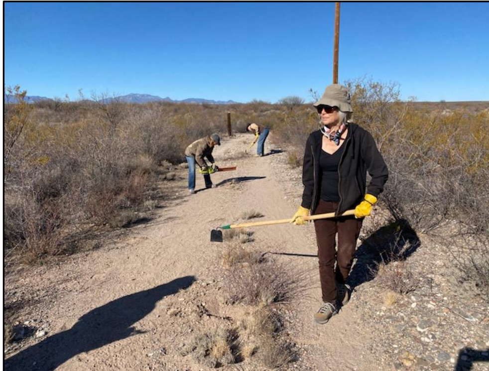
Figure 5: Escapule Adopt a Trail volunteers working on removing vegetation within the trail.