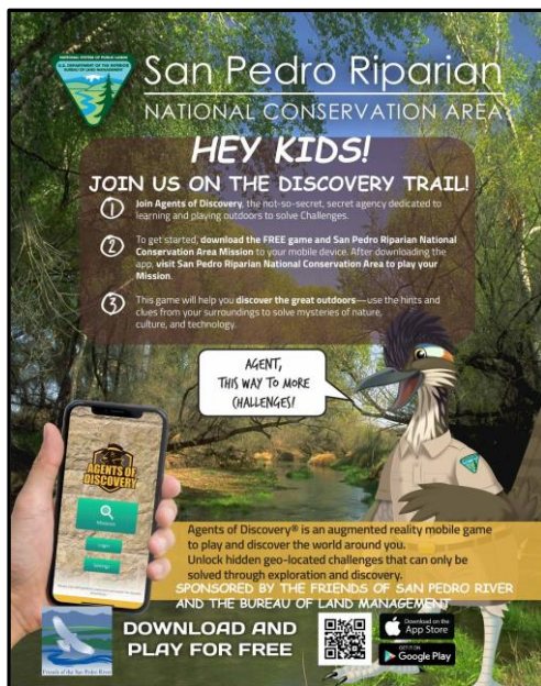
Figure 1. Agents of Discovery informational flyer for SPRNCA missions.