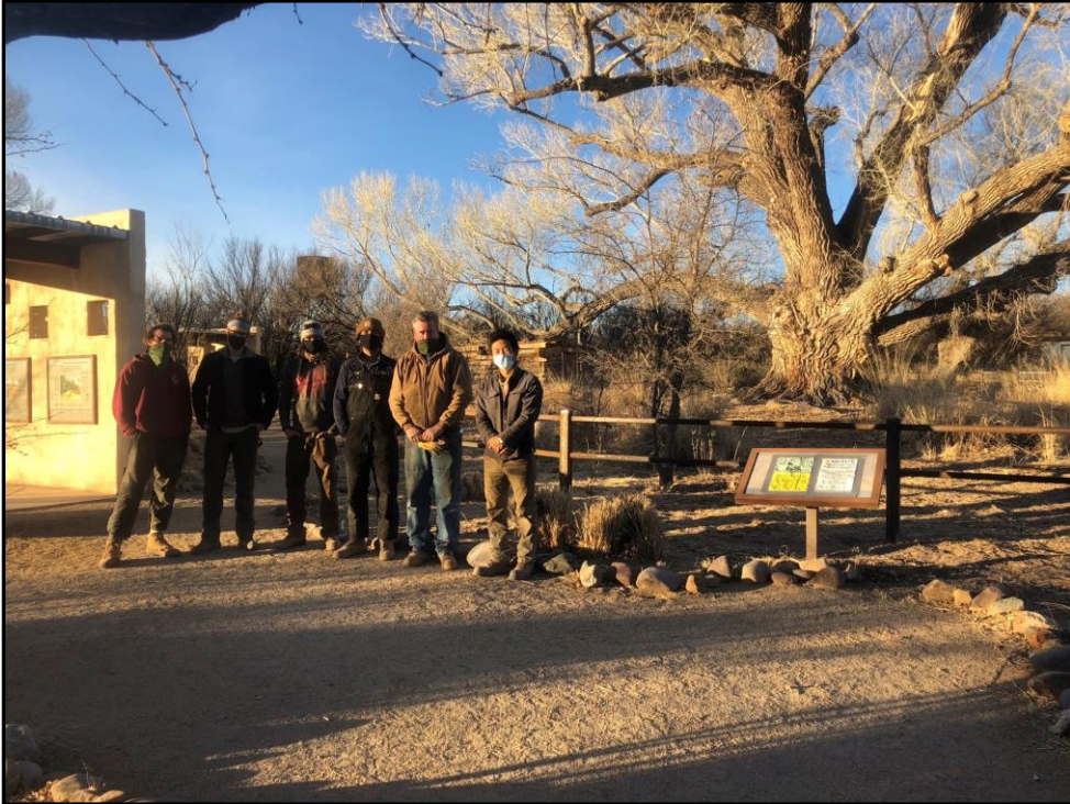
Figure 4. Vegetation clearing team at the San Pedro House.