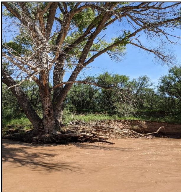
Figures 2 & 3. Monsoon waters in the San Pedro River following an unusually wet monsoon.