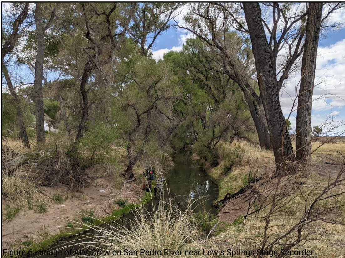
Figure 6- Image of AIM Crew on San Pedro River near Lewis Springs Stage Recorder.

The SPRNCA currently has five research and or study initiatives and all are ongoing. One is an ongoing fish population tracking study conducted by the Tucson Field Office. There are two ground water studies and one precipitation study being conducted by the TFO. The Sierra Club Water Sentinels, a local NGO, conducts surface water sampling, monitoring river health by testing for turbidity and other metrics.