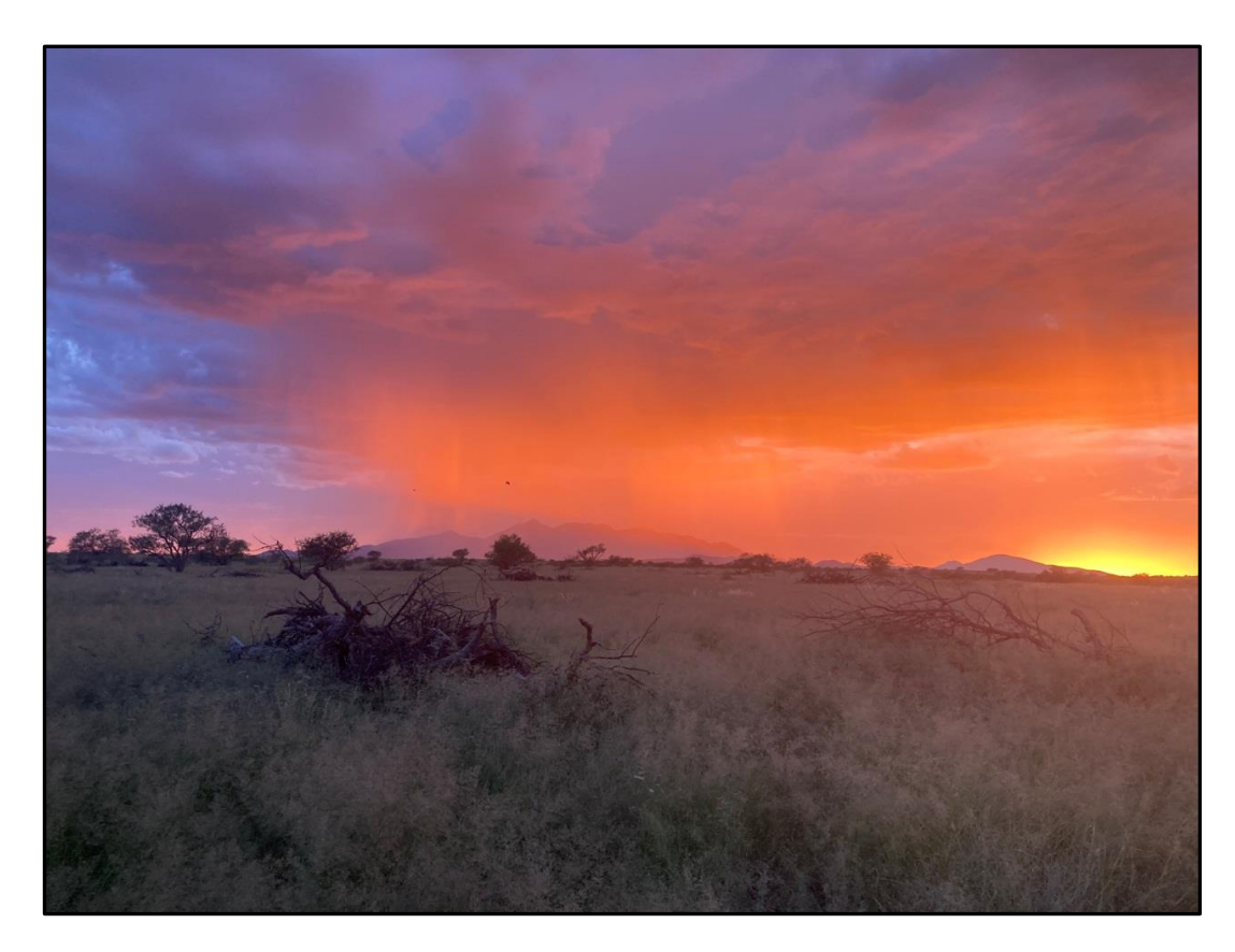
Figure 2. Slash piles remain from a mesquite ( Prosopis velutina ) removal treatment amongst a dense field of Lehmann's lovegrass ( Eragrostis lehmanniana ).