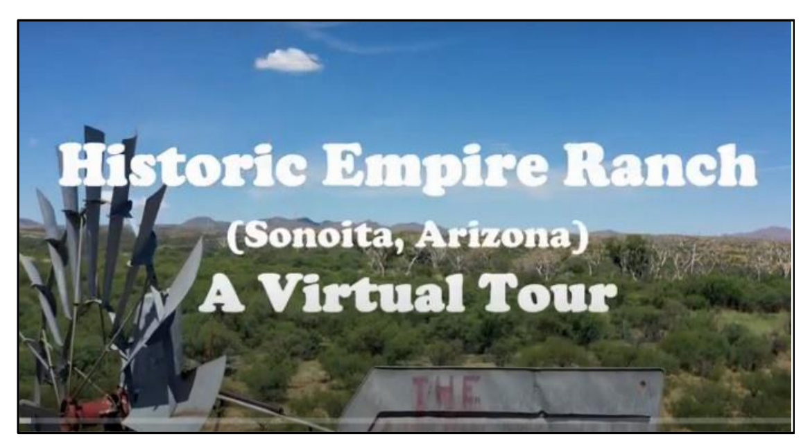
Figure 4. Empire Ranch House Virtual Tour for public viewing.

The ERF provides staffing for the Empire Ranch Visitor Contact Station at the Empire Ranch Headquarters several times a year. Under non-pandemic situations, docent tours are offered twice monthly, in addition to cultural events such as the annual Empire Ranch Roundup, which typically brings over 2,000 visitors to the LCNCA. Volunteer workdays are held every month to support maintenance and preservation efforts. Despite the limitations of COVID-19, ERF provided approximately 2,000 hours of volunteer service during 2021.