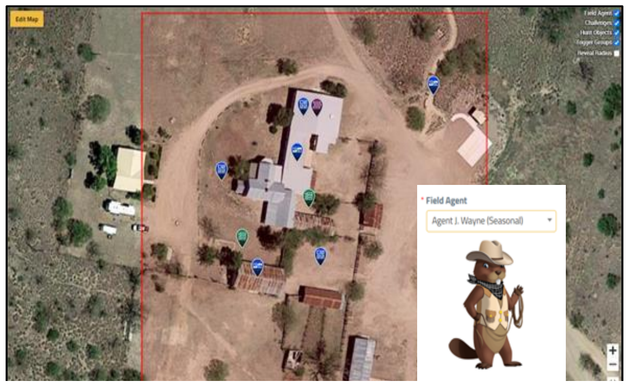
Figure 1. Agents of Discovery LCNCA Empire Ranch Mission.

Our Empire Ranch Foundation (ERF) partners developed fact sheets about the Empire Ranch AOD missions, and information on the AOD app as well as a virtual tour of the property and historical ranch house complex can be found on the ERF website. Partner and user feedback have been incredibly positive!