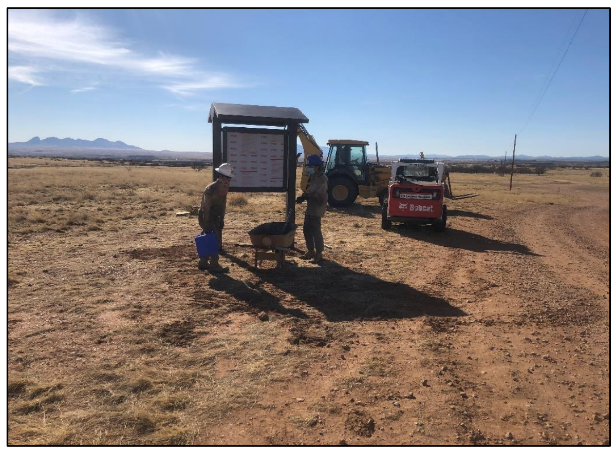
Figure 3. Installation of the Maternity Well Group Site information kiosk by BLM staff and ACE youth crews.