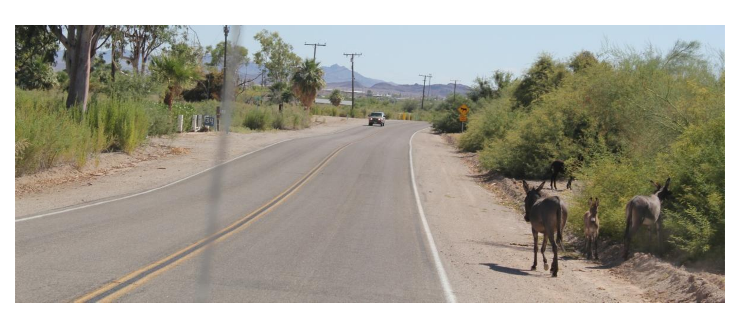
Outside Chemehuevi HMA, CA