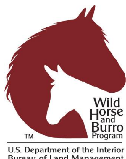
Bureau of Land Management