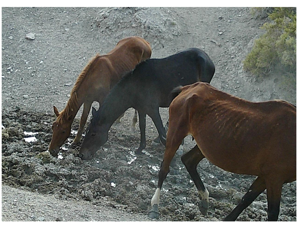
Triple B Complex, Nevada