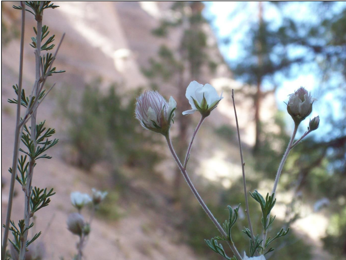
5 Close up of Apache plum in the Monument

The Kasha-Katuwe Tent Rocks National Monument Science Plan was completed in August 2020. No further action on science related projects have been done to date.