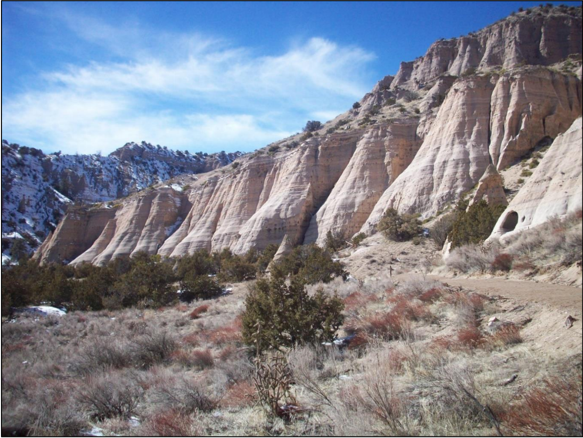
1 Geological formations in the Monument