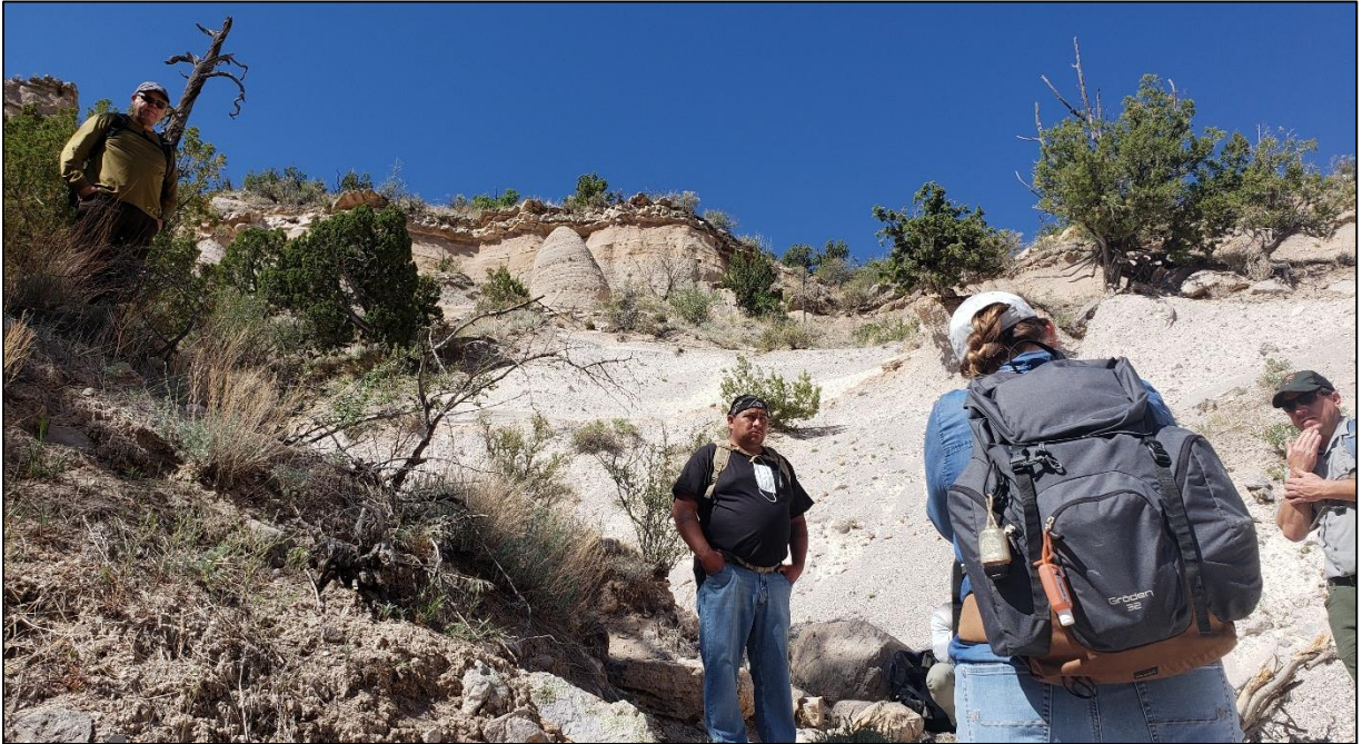
4 Visitors to the Monument

Monday after Easter; May 3; July 13 & 14; July 25; November 1; Thanksgiving Day; December 24; December 25; and December 31.