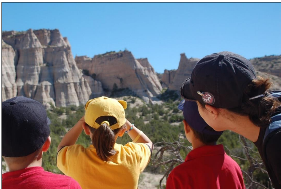
3 Youth enjoying the Monument

Upon reopening, BLM plans for a reduced visitation rate to be more in compliance to the area's Resource Management Plan (RMP). This RMP analyzed a stable visitation amount between 50,000 to 75,000 visitors annually. Through Recreation.gov the BLM can manage visitor use to protect resources and provide a more positive visitor experience. Recreation.gov, visitation limits, and supplementary rules are being evaluated in an Environmental Assessment to be completed by the time of reopening.