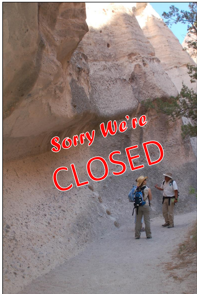
2 Trail Closure Picture

The Rio Puerco Field Office continues to receive many inquiries from the public regarding reopening status. A reopening plan was submitted to the Pueblo in 2021 which is evolving with updated guidance and changes in leadership direction. One of the primary concerns of the reopening is access to the monument. In 2021, Tribal Route 92 was removed from the National Tribal Transportation Facility Inventory (NTTFI). This road serves as the only route BLM and the public have to access the Monument. Management is continuing discussions with the Pueblo and BLM leadership in efforts to resolve the access issue.