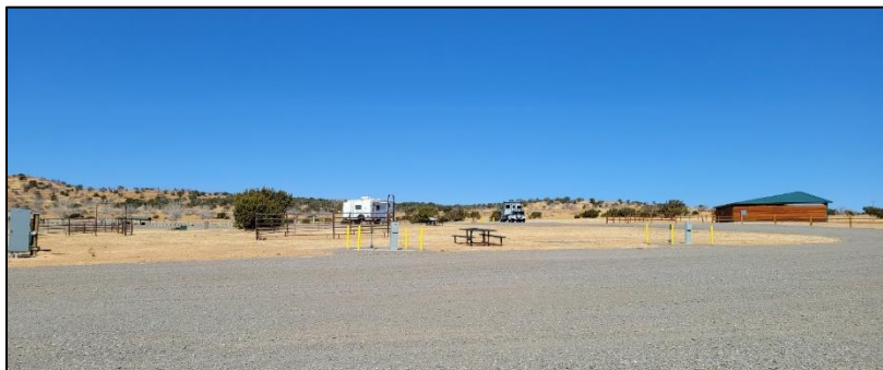
1 Rob Jagers Campground

In 2021, the Conservation Area used partners for the following projects: research continued with US Fish and Wildlife Service and Texas Tech University on migratory birds; the Fort Stanton Cave Study Project and other cave survey teams mapped more of the cave; the PLIA (Public Lands Interpretive Association) worked with BLM to develop a cave educational program which includes an in-classroom component, a videogame module, and a field trip into the cave; updated the cave MOU between the USFS Smokey Bear District and the RFO; and worked with State of New Mexico Historic Sites to build a spur trail on State land that connects to BLM trails.