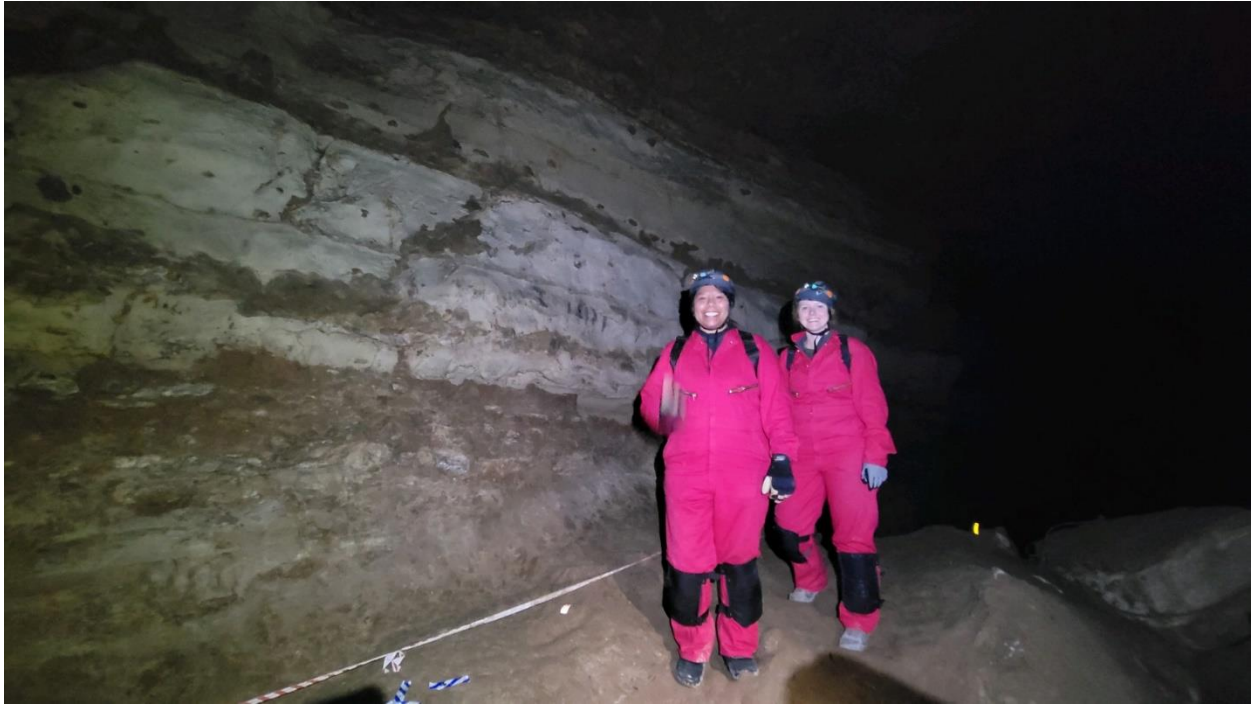
7 Cave researchers