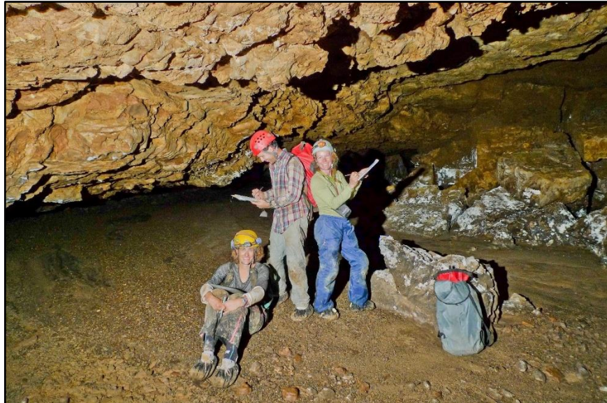
4 Cave researchers

The Conservation Area continues to host scientific research on both the Area's surface and in the Cave. On the surface BLM (with partners Texas Tech University, New Mexico State University, and the Fish and Wildlife Service) is in the 5 th year of an 8-year study on the effects Piñon and Juniper thinning projects has on migratory birds. Below the surface, there are many on-going research projects. The list includes: Toxicological Study on the Effects of Fluorescent Groundwater Tracing Dyes on Cave Bacteria; studying the geochemistry of the hydrologic system to investigate the source water for the cave; paleo climate, Composition and Metabolic Activity of Microbial Communities; Clastic Sediment Study and Pseudogymnoascus destructans ; and White Nose Syndrome testing.