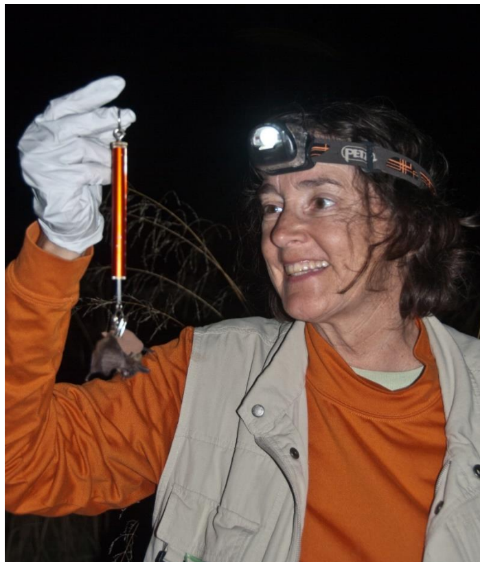
2 Researcher weighing bat

Stressors on non-cave specific natural resources result mostly from increased recreation use. Bonito Lake dam construction is planned to be finished within the next couple years. Once this is complete, and water is diverted back into the lake, this will affect the amount water coming down the Rio Bonito which flows through the Conservation Area.