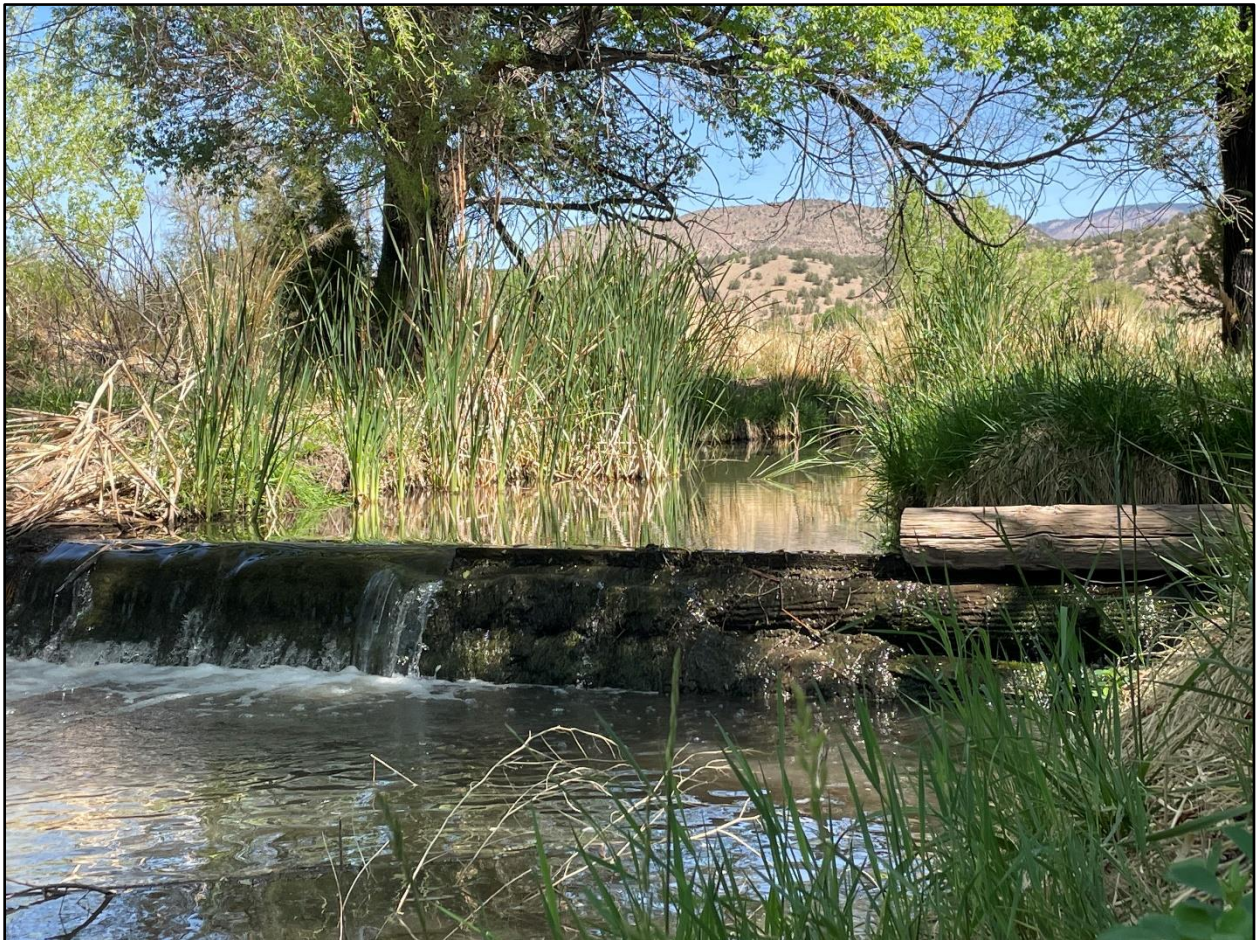
5 Rio Bonito

The Conservation Area is holding steady with the changing climate. It is noticeably warmer and dryer, with more extreme weather events. For now, stream flows seem to be stable within the cave and in the Rio Bonito. There is not much snowpack on Sierra Blanca Mountain this year. Last year the Conservation Area received record rain fall amounts, and record flood events along the Rio Bonito.