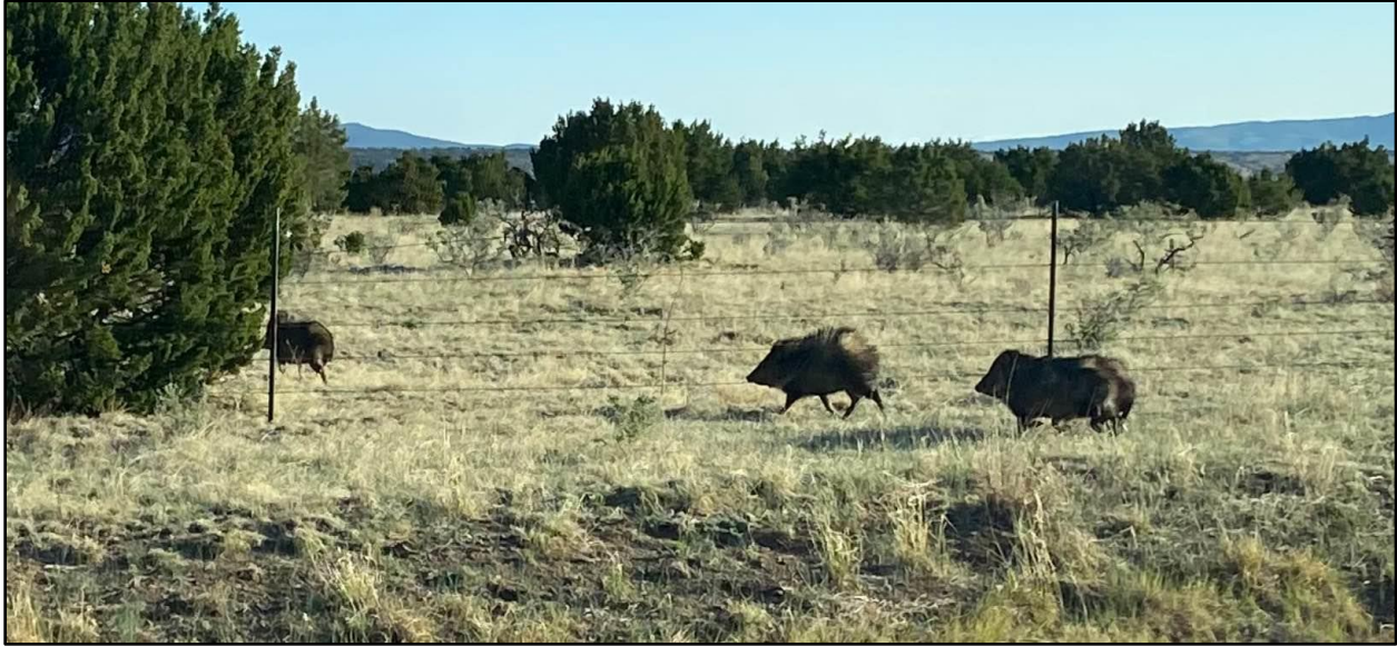
9 Javelina running in the Conservation Area