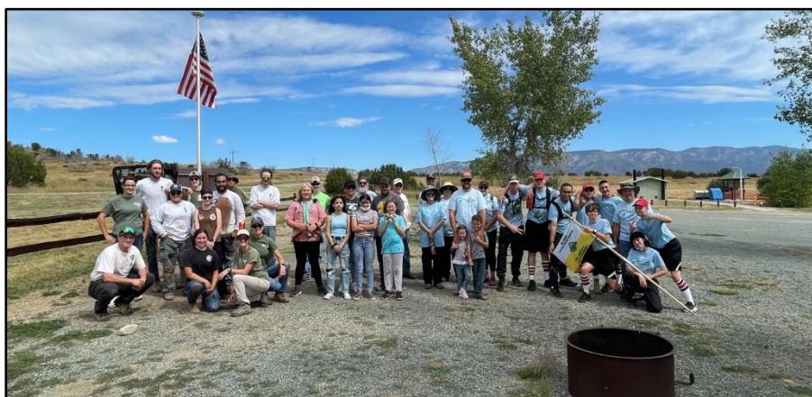
3 Volunteers in the Conservation Area

Continued research with US Fish and Wildlife Service and Texas Tech University will help monitor the effects of the vegetation thinning on migratory birds. In collaboration with the Fort Stanton Cave Study Project and other cave survey teams, 0.5 miles of new passage was mapped in the Snowy River Cave Complex in FY 2021. The Cave is now the 10 th longest cave in the USA, and the 44 th longest in the world. Yearly entries to Fort Stanton Cave increased to 275 and will be increased to 350 in 2023. BLM approved a new assistance agreement with PLIA to develop a cave educational program for 7 th graders in Lincoln County and Mescalero Middle schools.