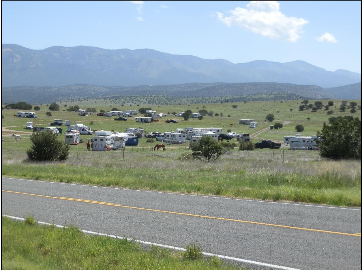
8 Equestrian event in the Conservation Area