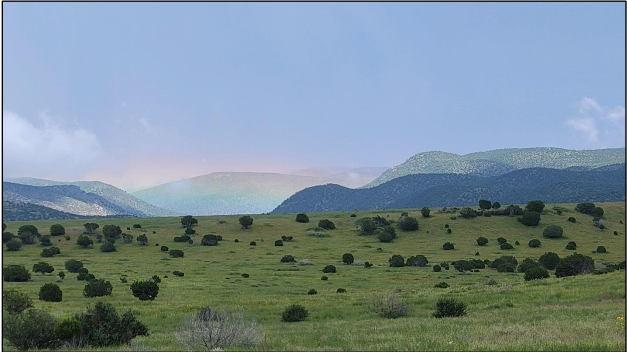
6 Fort Stanton-Snowy River Cave NCA

The Conservation Area is proving to be resilient to climate change. All vegetative and wildlife species are accounted for and in a healthy condition. Preventative fuels treatments, stream restoration projects and prescribed fire are helping maintain a healthy eco-system.