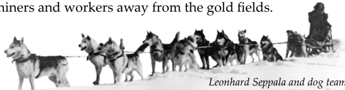
Leonhard Seppala and dog team

By 1918, the stampede reversed itself. New winter mail contracts bypassed the fading town of Iditarod in favor of more direct routes to Nome, and World War I drew young miners and workers away from the gold fields.