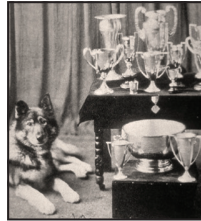
Togo, the famous lead dog for Leonhard Seppala's dog team on the Serum Run, with trophies awarded for saving Nome, Alaska.

In the winter of 1925, a deadly outbreak of diphtheria struck fear in the hearts of Nome residents. There was not enough serum to inoculate everyone and winter ice had closed the port city from the outside world. Serum from Anchorage was rushed by train to Nenana. Twenty of Alaska's best mushers and their sled dog teams relayed the serum 674 miles from Nenana to Nome in less than five and one-half days!