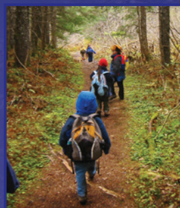
The Iditarod Trail in Girdwood is a favorite with hikers of all ages.

One hundred years after its heyday, some variation of the entire historic Iditarod Trail from Seward to Nome is still open to the public.