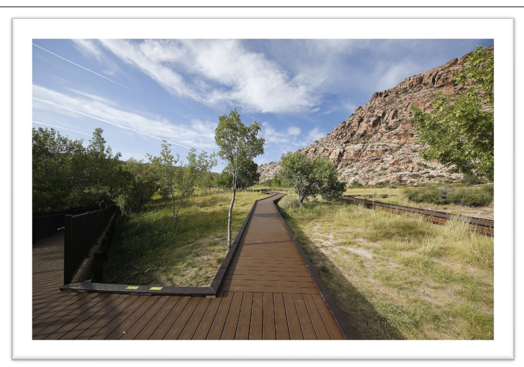
RRCNCA Red Spring Boardwalk Renovation