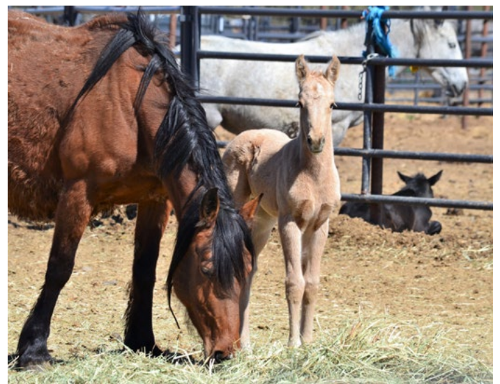
Horses at an off-range corral.

USDA is an equal opportunity provider, employer, and lender.