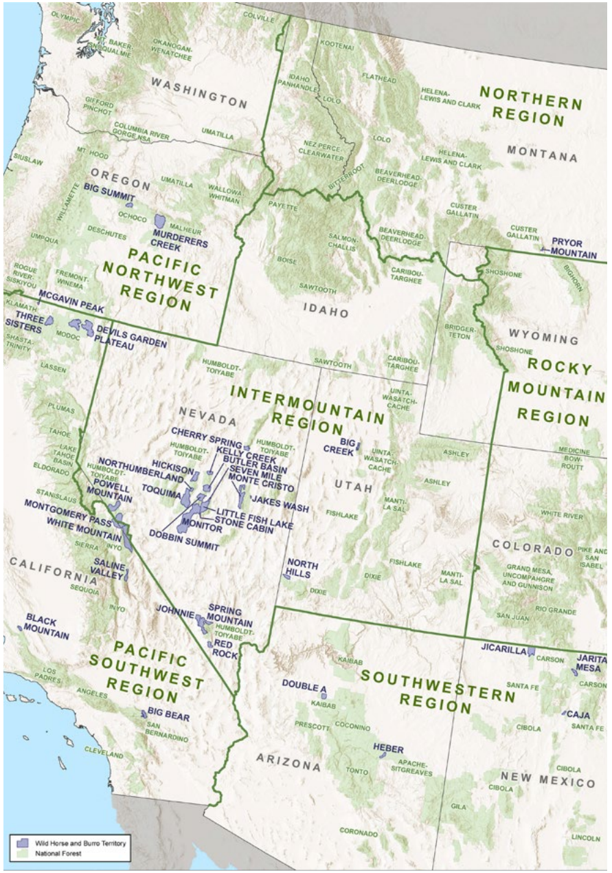
A map of the active wild horse and burro territories in the USDA Forest Service.