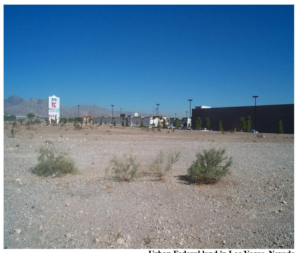
Urban Federal land in Las Vegas, Nevada